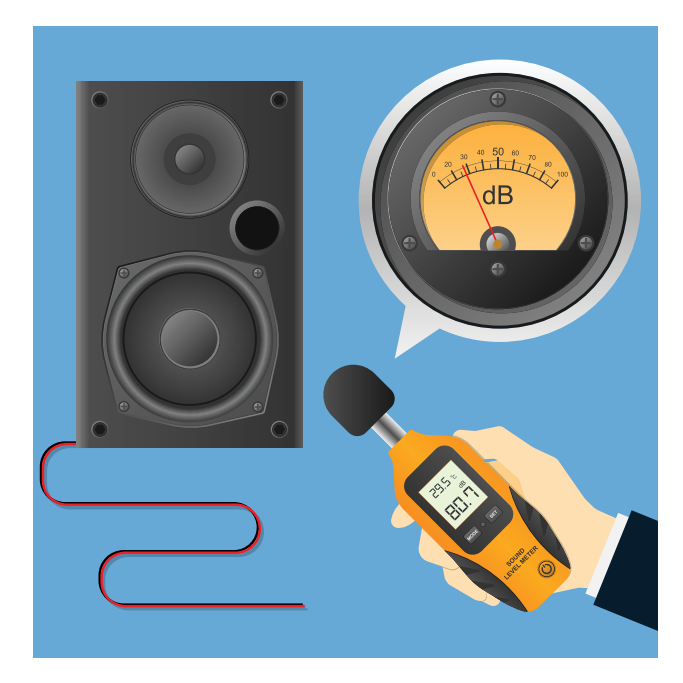
Example of a noise limiter

Business operators should also consider other best practice controls and management such as ensuring that loudspeakers are appropriately positioned and that excessive low frequency bass is controlled or limited.