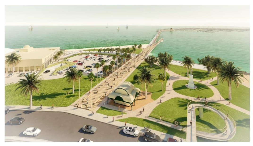
Figure 03. - Artist's Impression - Council funded Landside Upgrade