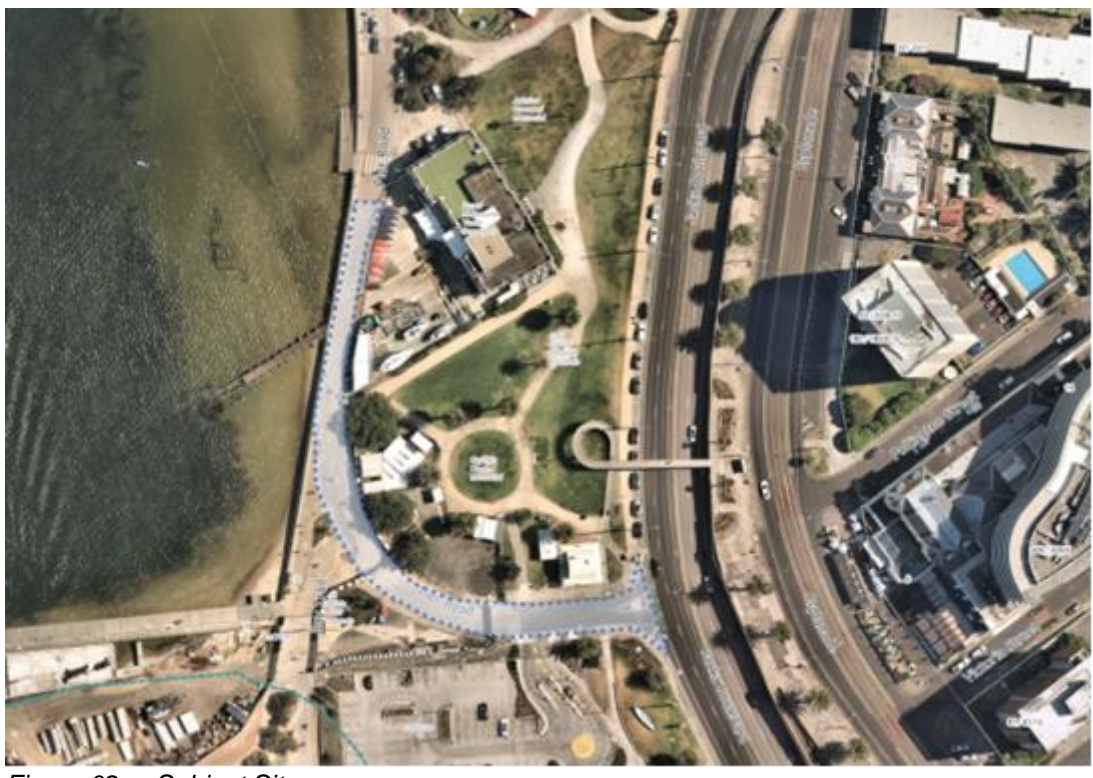
Figure 02. - Subject Site