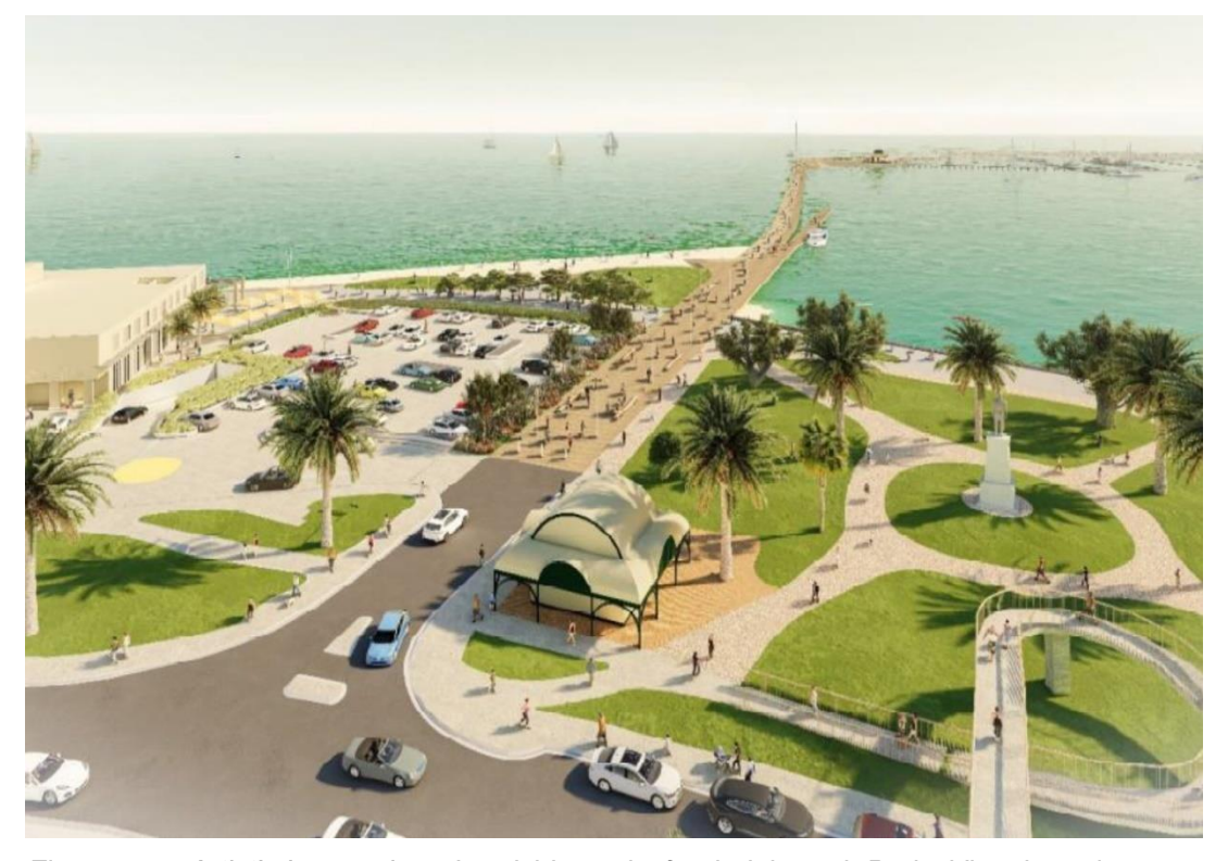
Figure 01. - Artist's Impression - Landside works funded through Parks Victoria project

4.1 Continuation of the Pier extension to Jacka Boulevard to create an iconic visitor entrance with consideration to safety, access and public viewlines will reconnect the Pier to S Kilda foreshore landscape in a manner that respects the important history and function of the site.