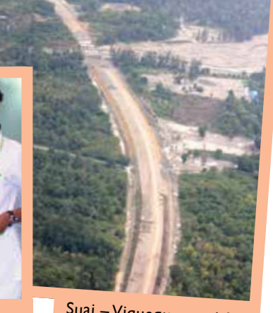
Suai – Viqueque road for oil and gas development costing $1.5 billion. Progress, but many land care, environmental and health concerns from local communities. Major roads in and around Suai are also being repaired using heavy equipment.