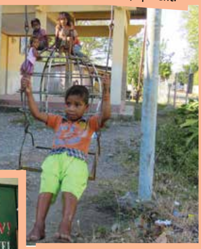
A new fence at the Suai kindergarten thanks to the Rotary Club of Sorrento. The recent adoption of a CCC Child Protection Policy is a significant achievement.