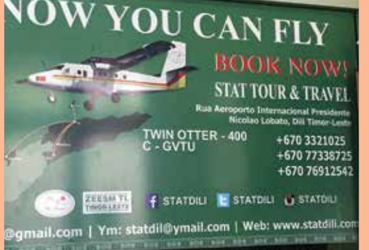
You can now fly to Suai with a new $50 air service provides a 25 minute gateway to Covalima and Oecusse.

New markets for produce and handicraft for women are being explored. The work in gender equality is impressive with an ongoing emphasis on women's leadership as well as a focus on prevention of domestic violence to