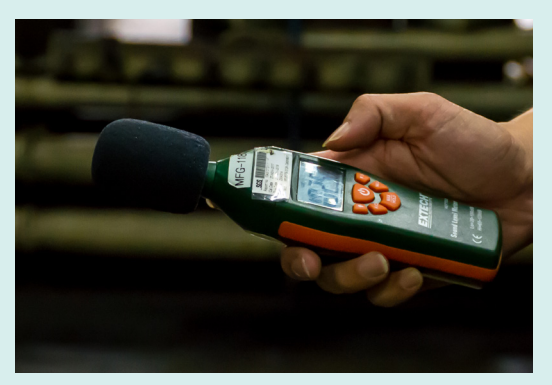
Sound Level Meter

Measuring the impact of noise normally involves the comparison of background environmental noise (i.e. the noise that would occur without the commercial operation) against the noise emitted by the proposed operation. From this, it can be determined whether noise from a business will be unreasonable at a particular location.