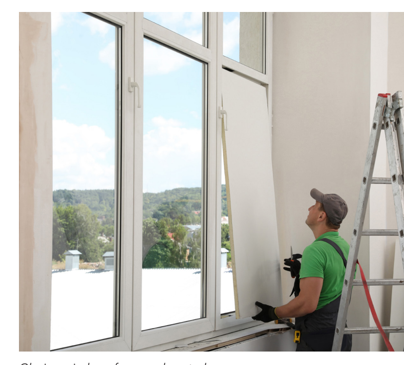
Glazing windows for sound control

Assessing noise impact is a technical task that can be quantified and typically requires specific expertise. You should engage a suitably qualified acoustic consultant to ensure you are getting the correct advice for your specific situation.