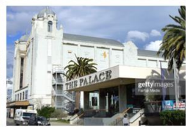
Figure 1: Evolution of the site

4.3 Conditions today are historically unusual with only the one building, and most of the site used for car parking. Figure 2 shows the footprints of venues on the site at snapshots in time.