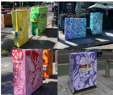
Sending a creative signal