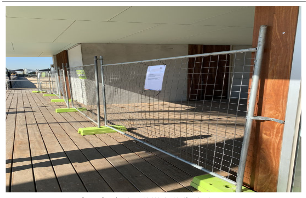
Stage One fencing with Works Notification letters

*Please note: answers to any questions during Councillor Question Time which were answered at the meeting are included in the minutes of that meeting.