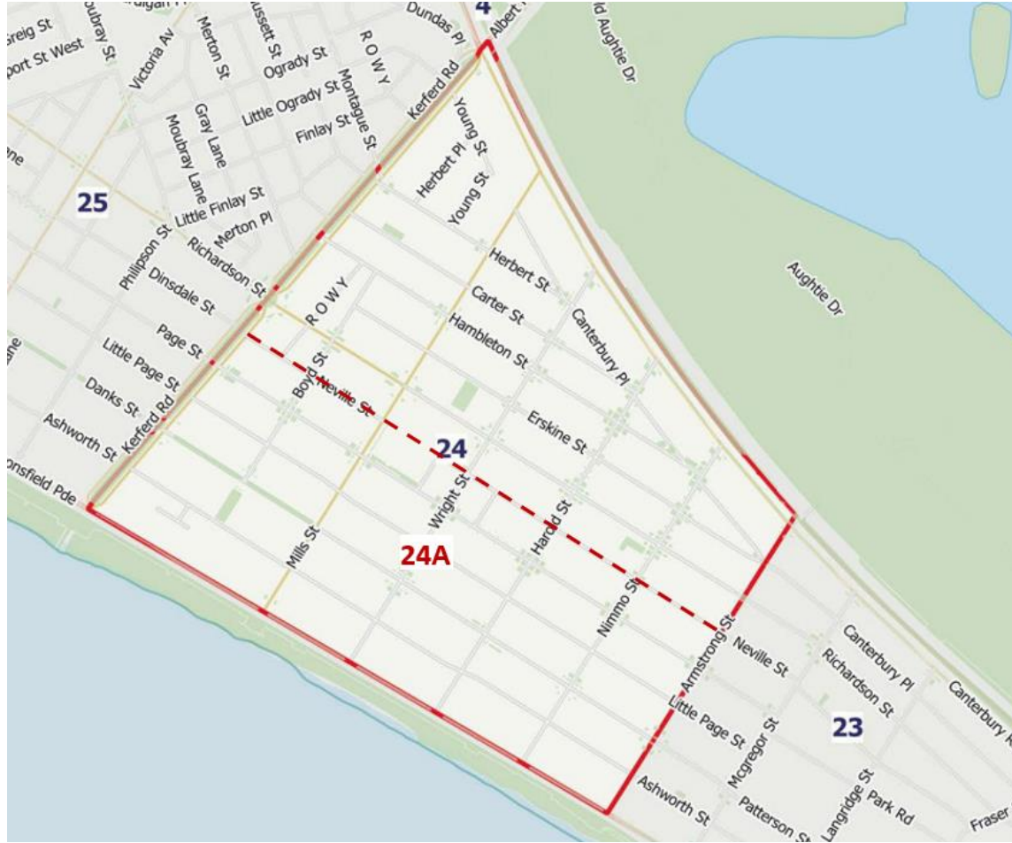
Figure 3: Proposed Change to Area 24 - Split into two areas along Neville St