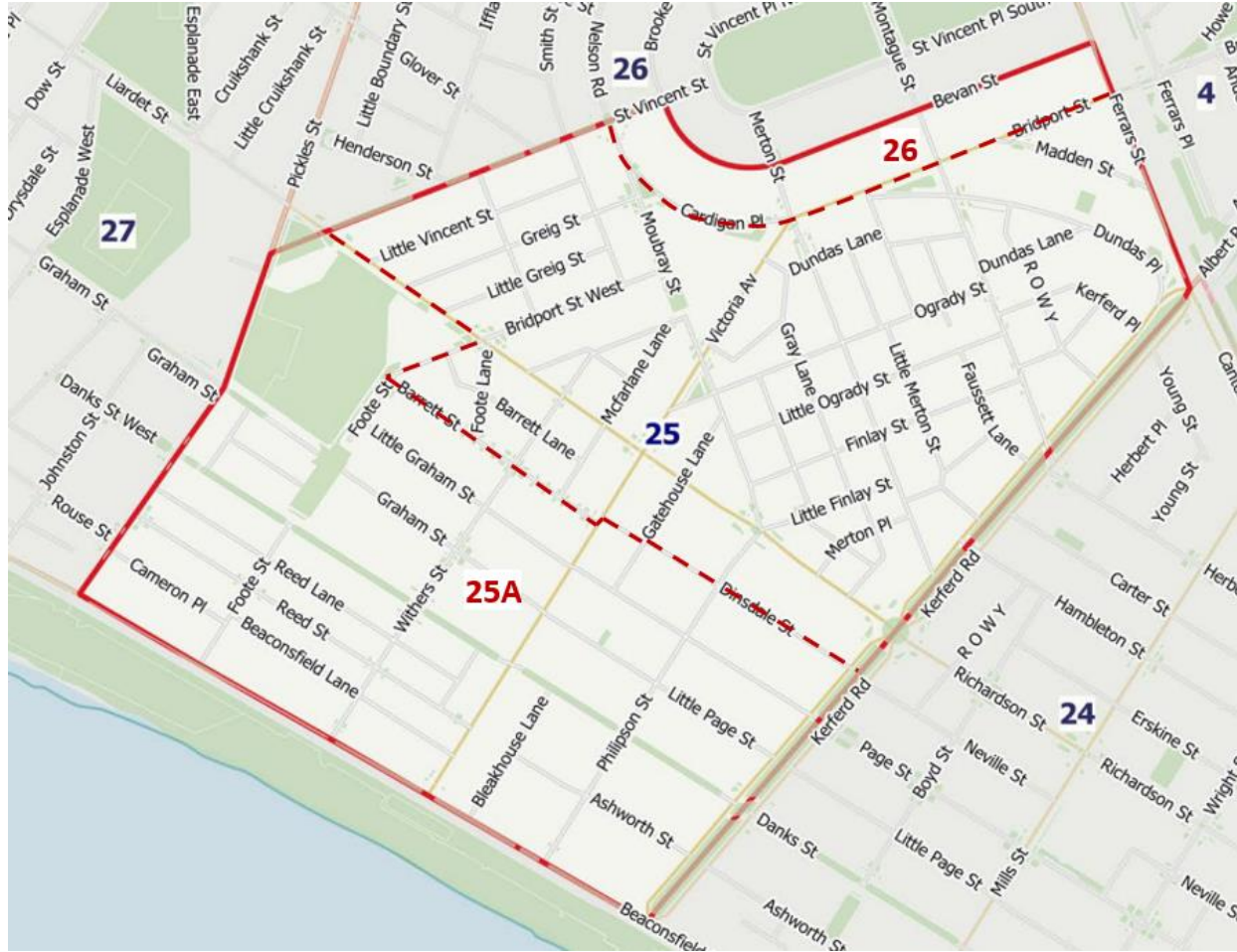
Figure 4: Proposed Change to Area 25 - Split into two areas along Dinsdale St and Barrett St, and move the boundary from Bevan St to Bridport St