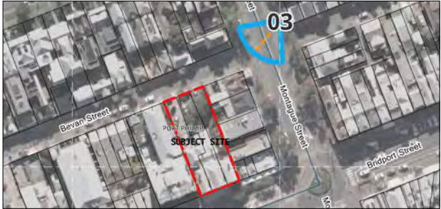
View 03 - Endorsed Built Form with Landscaping

180° 190° 200° 210° 220° 230° 240° 250° 260°