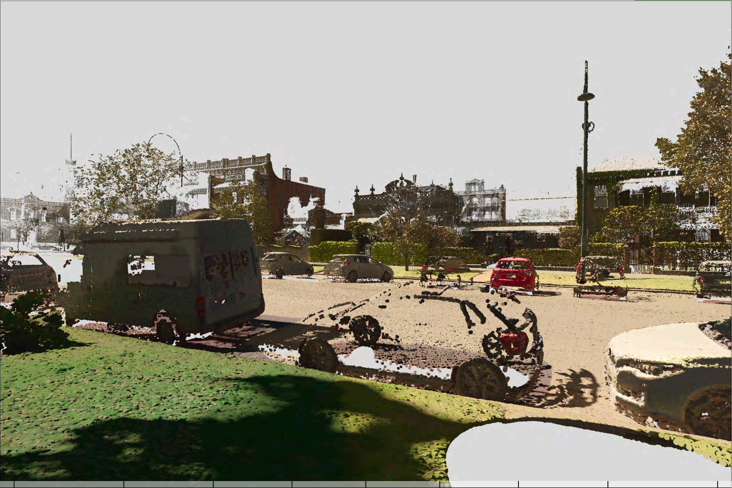
View 04 - AlignView with Point Cloud Dataset