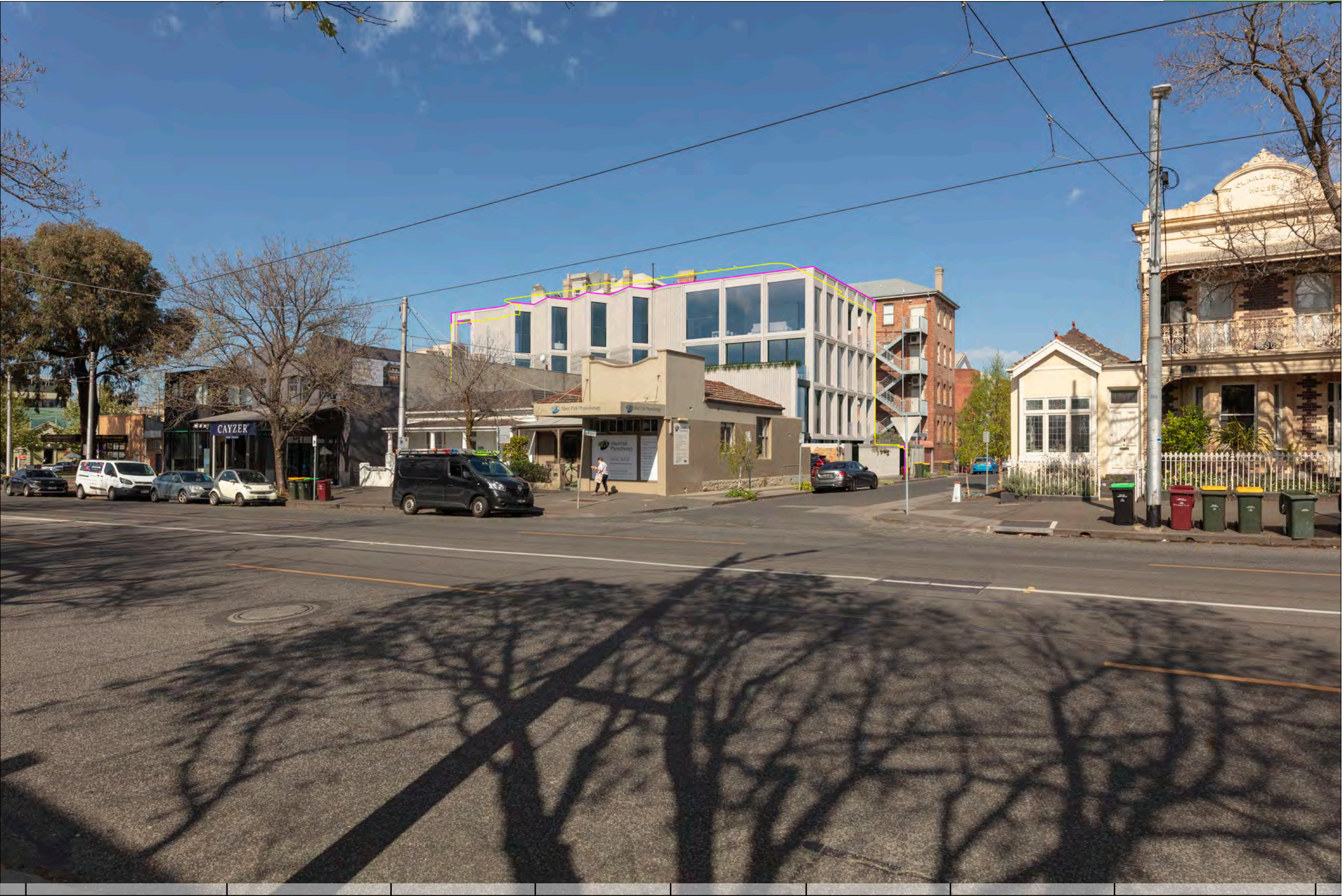
View 03 - Endorsed Built Form with Landscaping & Endorsed and Proposed Building Outlines