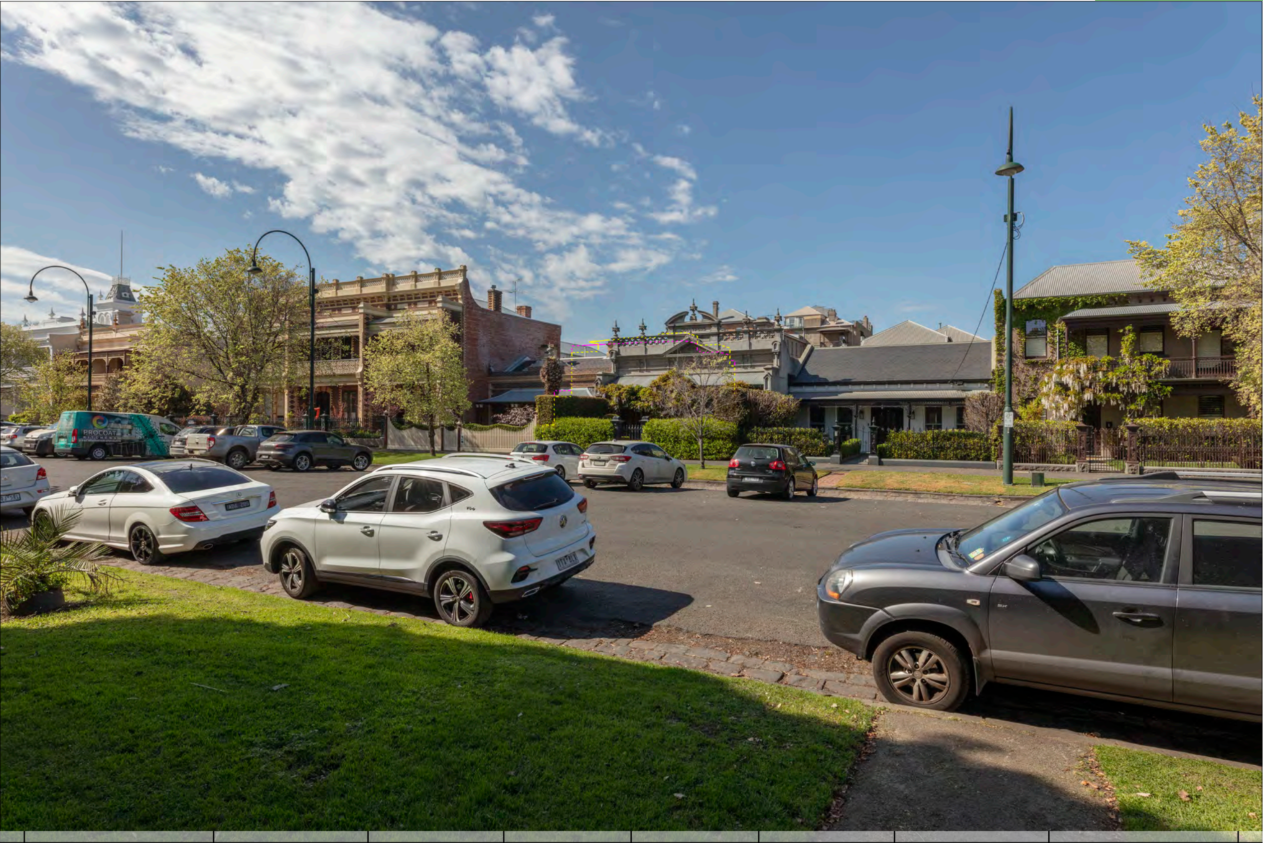
View 04 - Photograph with Endorsed and Proposed Building Outlines