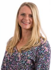
Mayor Heather Cunsolo City of Port Phillip

The safer people feel, the more likely they are to participate in, and enjoy, community life in our beautiful City.