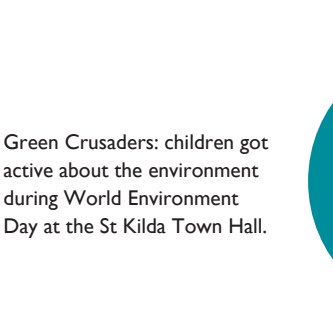
Green Crusaders: children got active about the environment during World Environment