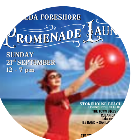
Boardwalk by the bay: the first stage of the St Kilda promenade upgrade was launched in September. With wide paths and magnificent boardwalks, the promenade is popular for both strolling and rolling – and taking in the view.