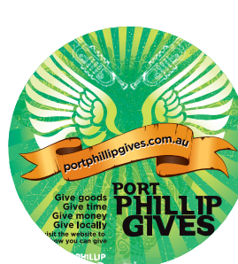
Who gives: Port Phillip Gives makes giving time, money and goods easier. Visit the website to discover volunteer opportunities and more.