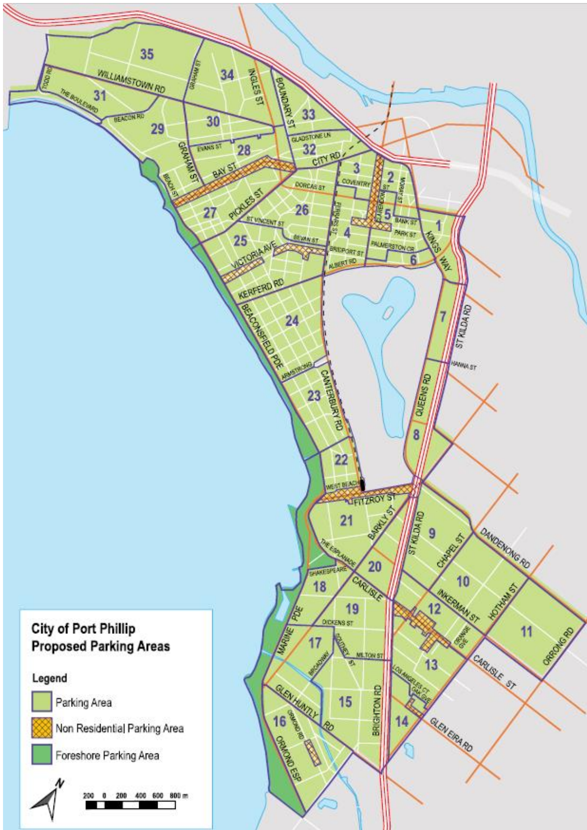
Figure 3: Residential Parking Area map