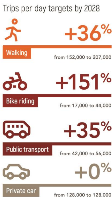
Figure 1: Mode share targets from Move, Connect Live: Integrated Transport Strategy

In 2018, Council adopted the Move, Connect Live: Integrated Transport Strategy 2018-28 (the Strategy) to address the challenges facing Port Phillip from a transport and liveability perspective, particularly as the population in and around the municipality grows. This strategy also sets a clear target for minimising car trips by providing real transport choices for residents, employees and visitors as outlined in Figure 1 below.