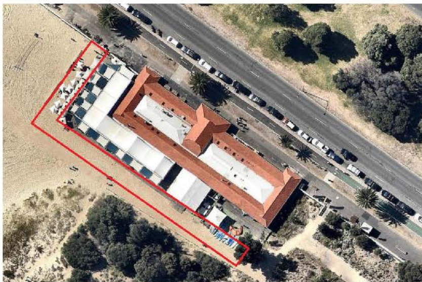
2. Proposed Increase of Liquor Licence - 330a West Beach Pavilion – Nearmap 28/3/18