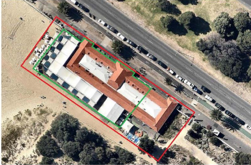
3. Context of Lease Area (Red) and current Liquor Licence Area (Green) – Nearmap 28/3/18