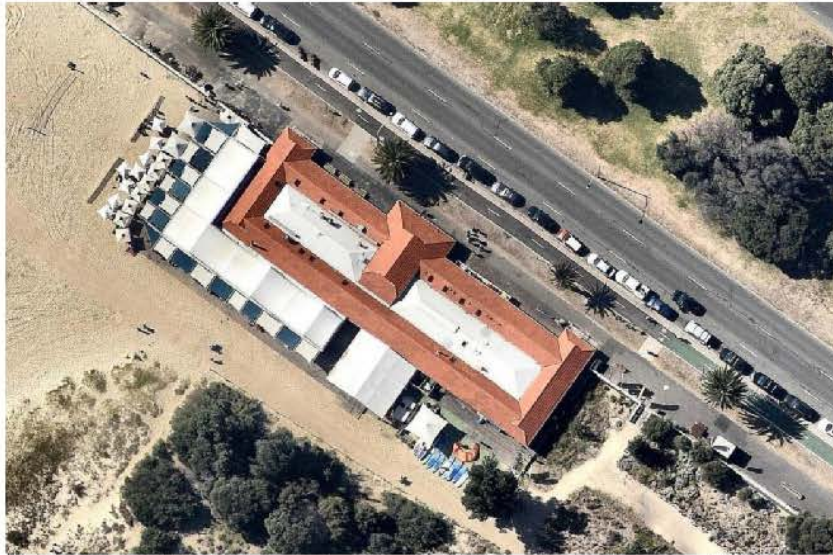
1. Current Footprint - 330a West Beach Pavilion – Nearmap 28/3/18