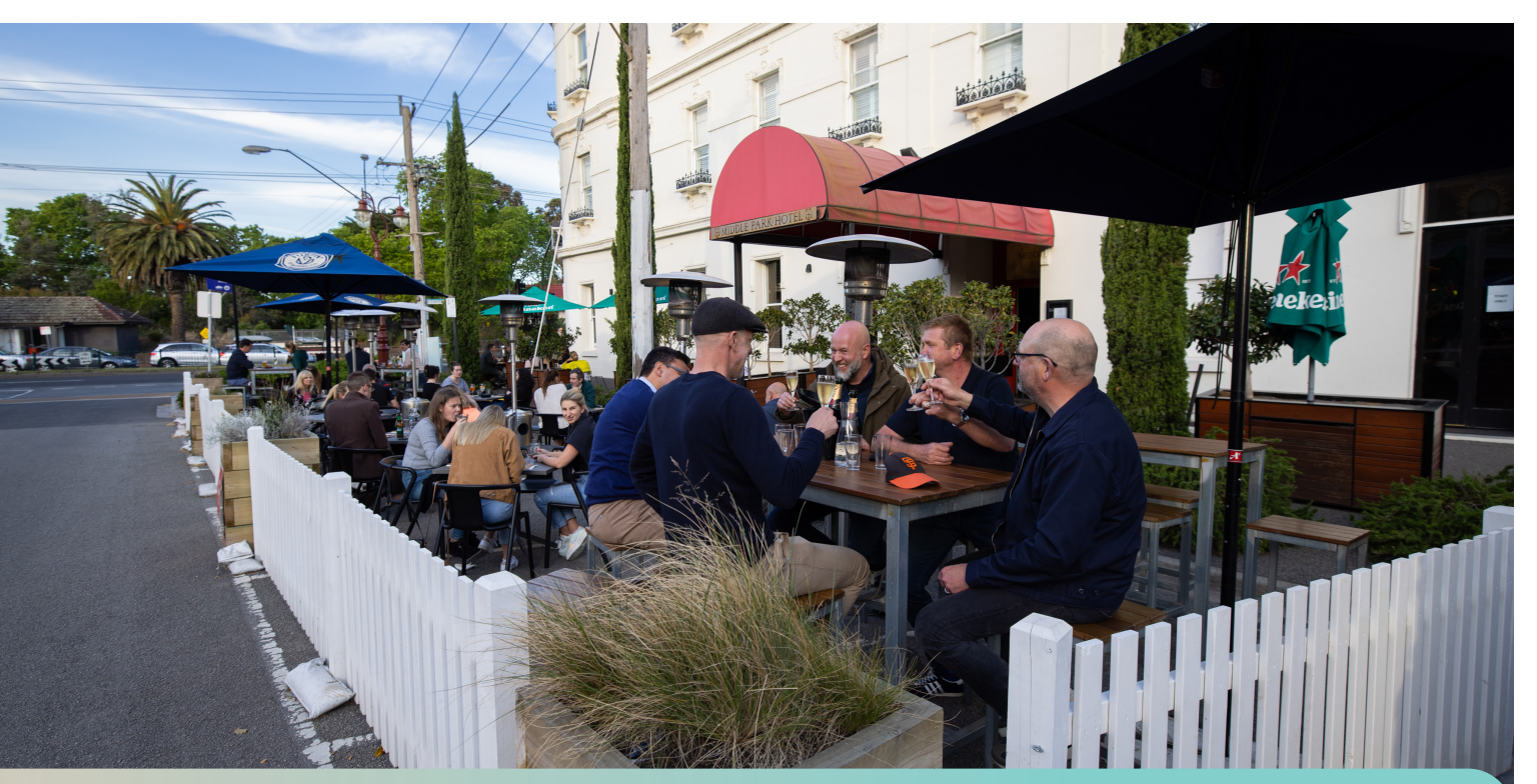
Regulations & Registrations | Footpath Trading

Before June 30 each year, a renewal notice is issued to all existing permit holders. It is the responsibility of the permit holder to ensure all permit renewal details including public liability, amendments and fees are forwarded to Council. Failure to provide all renewal documentation and fees will result in the cancellation of the permit.