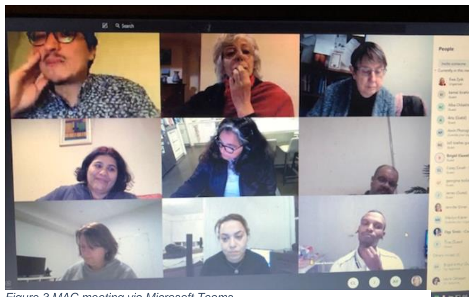
Figure 3 MAC meeting via Microsoft Teams

An induction session for the incoming Committee members was held on 19 November 2019, where members were orientated to the ToR and completed an 'Active Citizenship" workshop with the Victorian Electoral Commission.