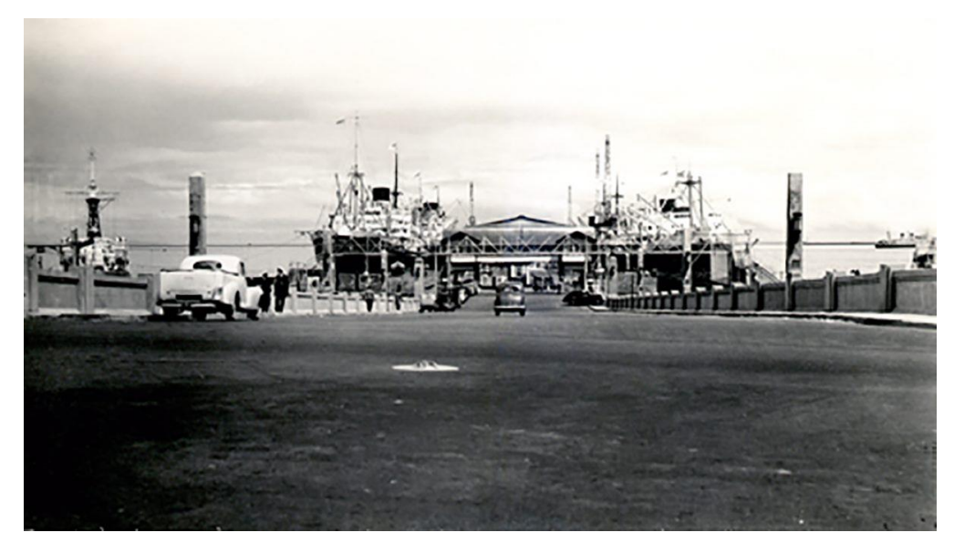
Figure 6: Pictured: Station Pier, Port Melbourne 1950s