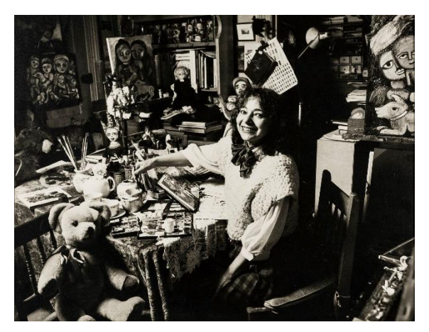
Figure 5: Pictured: Mirka Mora, 1985