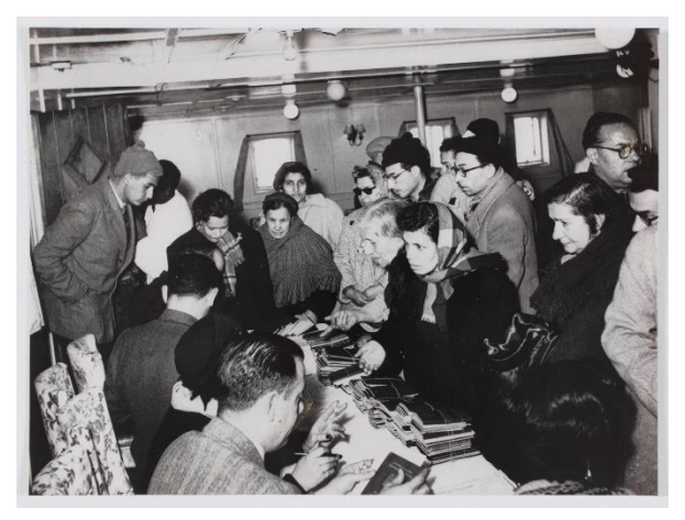
Figure 4: Pictured: Migrants on the Oronsay, 1939, Image: Jewish Museum of Australia Collection

At the start of the week, Council featured a Virtual Photo exhibition of the refugee Jewish experience in the City of Port Phillip via Council's social media. This was done in partnership with the Jewish Museum.