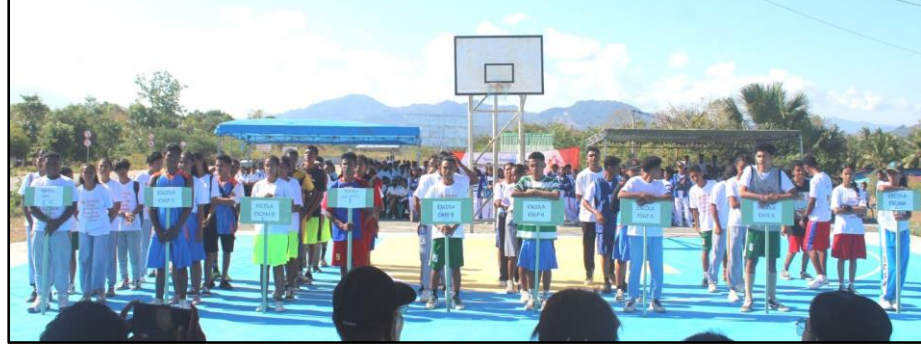
Photo: Four secondary schools in Suai competed in the inaugural tournament at Suai Senior Secondary school.

Four schools competed in the first interschool basketball tournament at the Suai Secondary School in September. The basketball court was resurfaced and upgraded with funds from Friends of Suai supporters including Albert Park College students and the Port Phillip Basketball Association (PPBA). A further donation of basketballs and trophies from PPBA will be sent to Suai this month and distributed to ten schools in and around Suai.