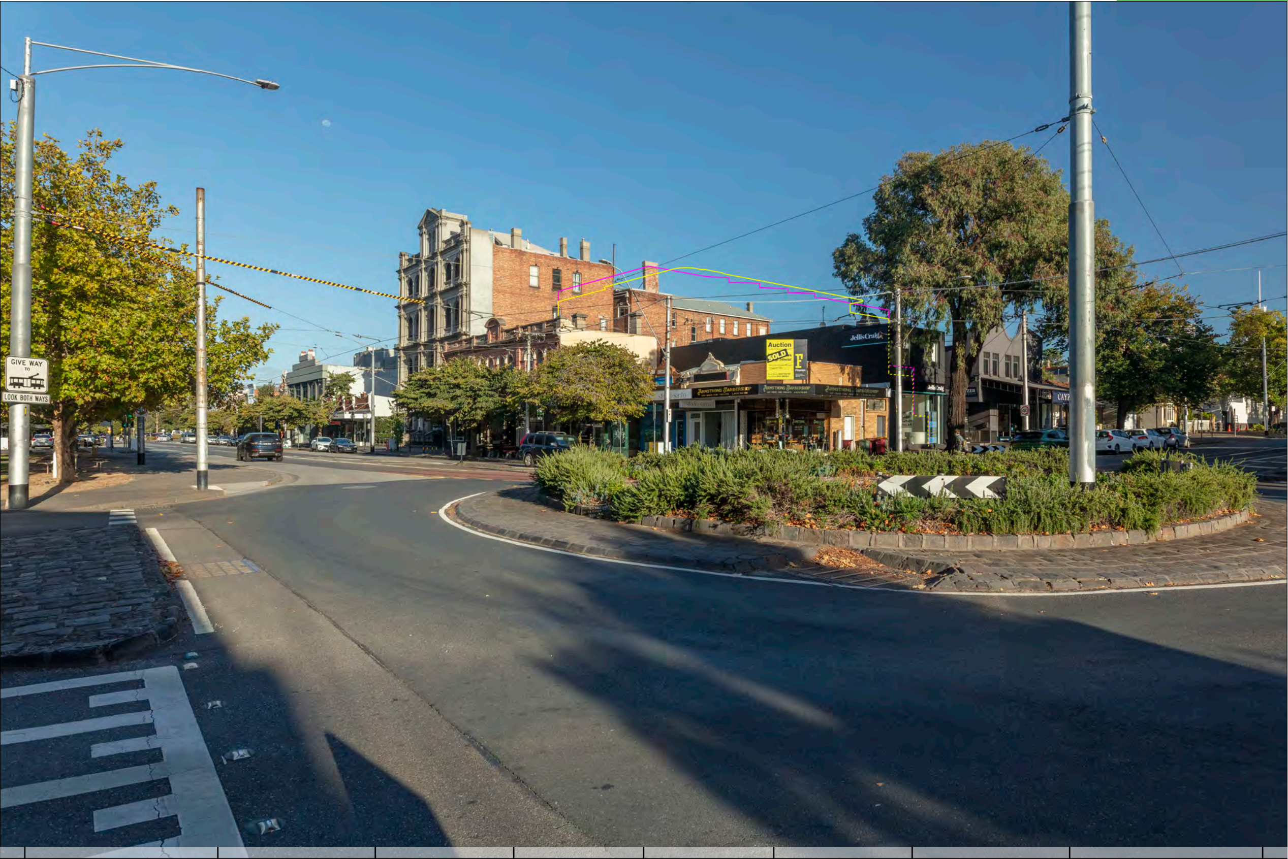
View 05 - Photograph with Endorsed and Proposed Building Outlines