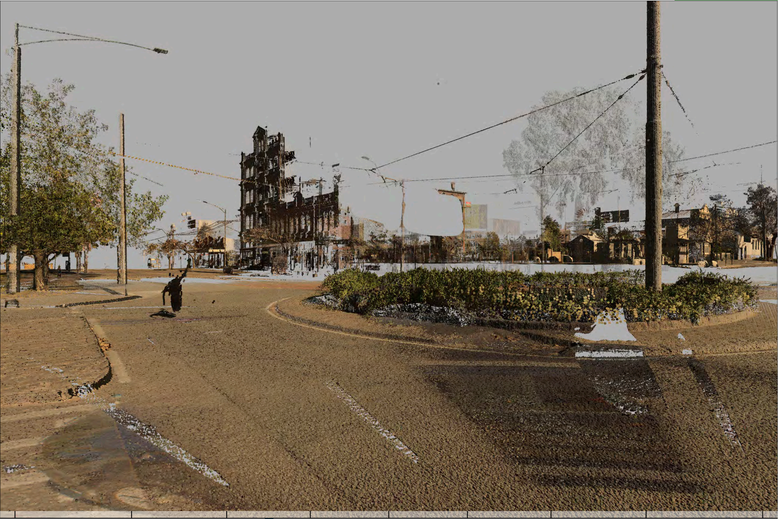
View 05 - AlignView with Point Cloud Dataset