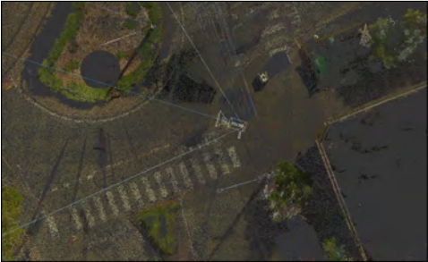
Point Cloud Survey Top View