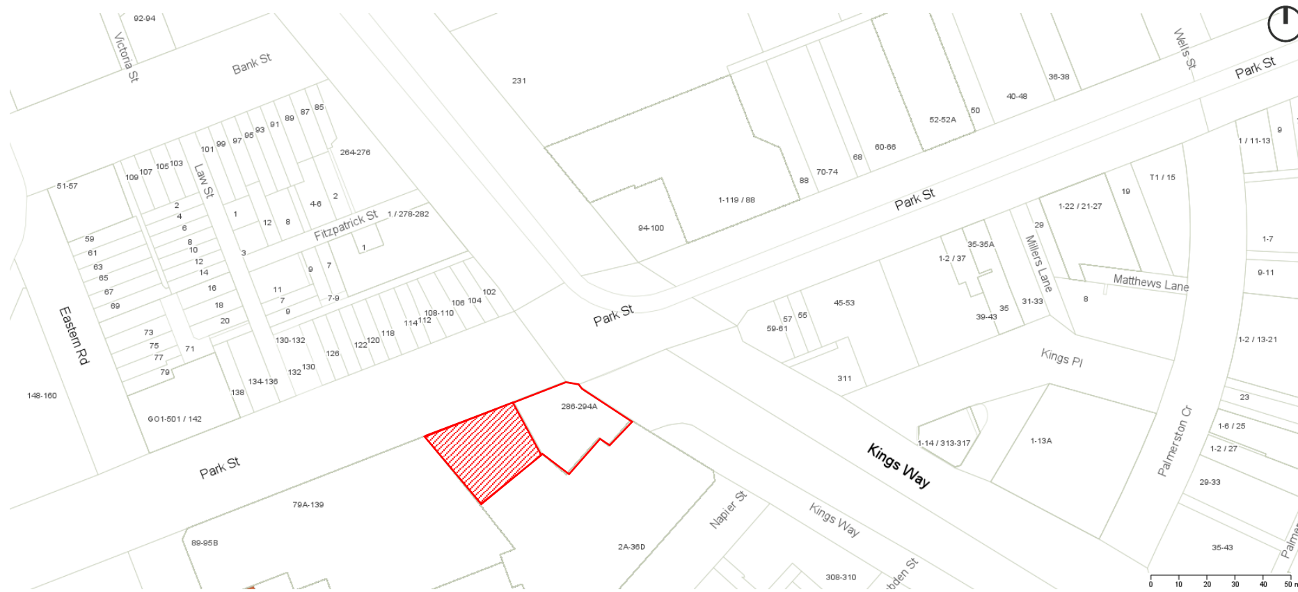
Map 1: Existing site location