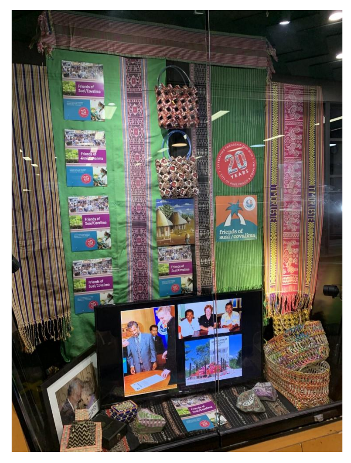
Window display at St Kilda library to launch the 20-year commemorative booklet

Stories from the booklet were shared on the FoSC Facebook page and via email during May and June. The booklet is to be launched online and distributed in July 2020. It will also be added to the Port Phillip library collection and a window display was set up in June to promote its availability.