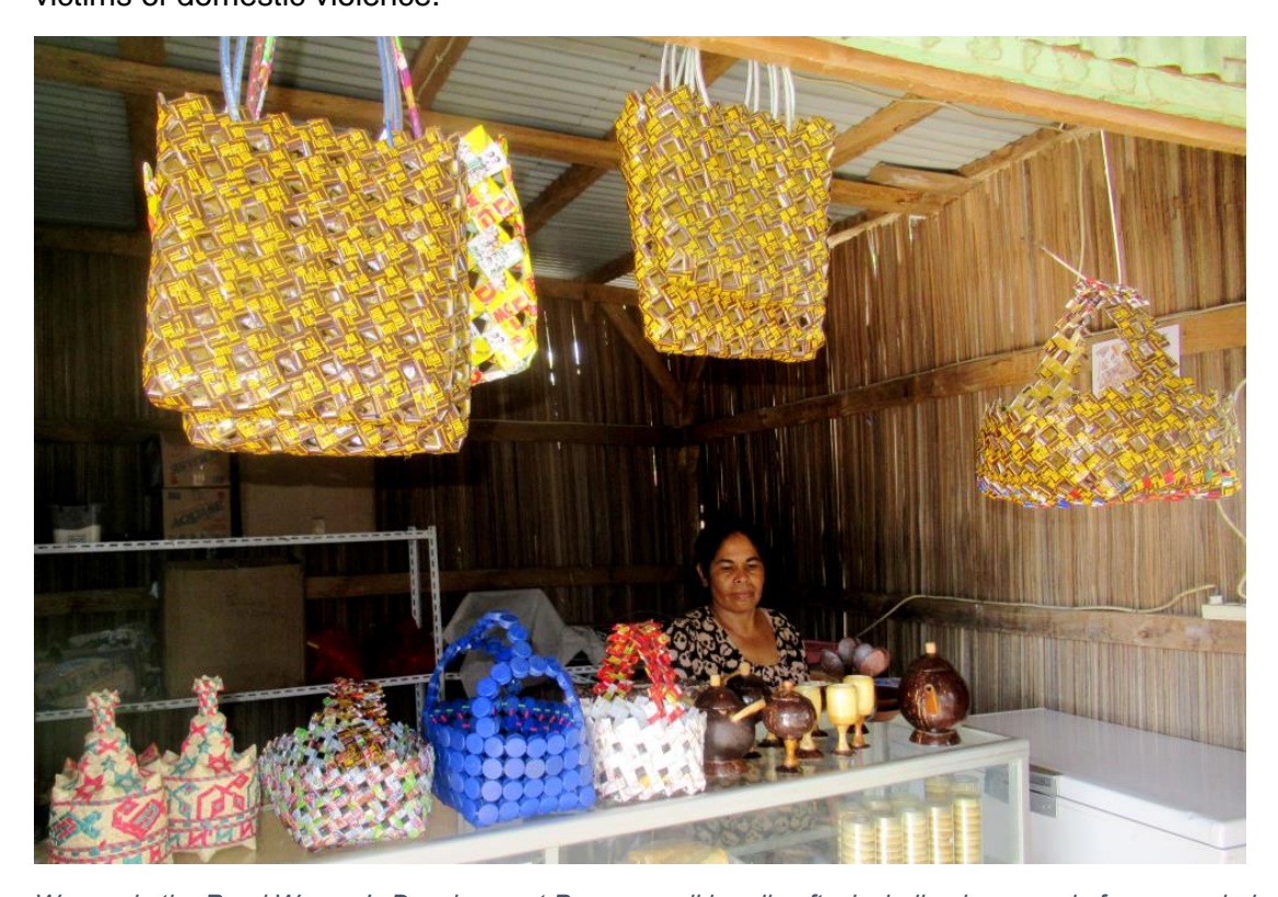
Women in the Rural Women's Development Program sell handicrafts, including bags made from recycled plastic

The partnership with IWDA has expanded to include implementation of a Women's Leadership program so that women can be active participants in village councils. More than 50 women have participated in training called 'Good Decisions, Good Leadership' to develop their confidence and skills in leadership, facilitation, public speaking, conflict resolution and models of decision making. A further objective is to ensure that women understand gender equality and referral pathways for victims of domestic violence.