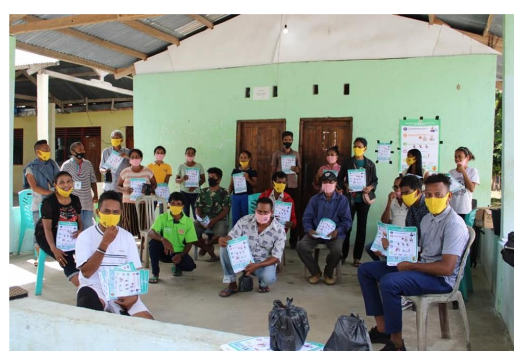
WHO posters have been distributed to 125 villages in Covalima district

The CCC has also been invited to join the District Disaster Management Committee, in the area of Prevention, Preparation and Mitigation. This is in recognition of their programs that support Disaster Risk Reduction activities. As part of the taskforce, they are involved in rapid assessments for disasters, including the emergency response after flash flooding events that occurred in Covalima.