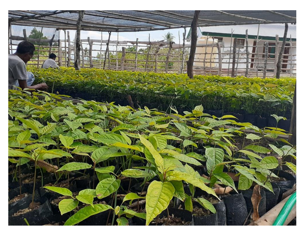
10,000 seedlings were grown in the WithOneSeed nursery and distributed to farmers

FoSC is committed to supporting the establishment of this fantastic initiative as it will have a significant environmental and economic impact in the communities in Tilomar sub-district.