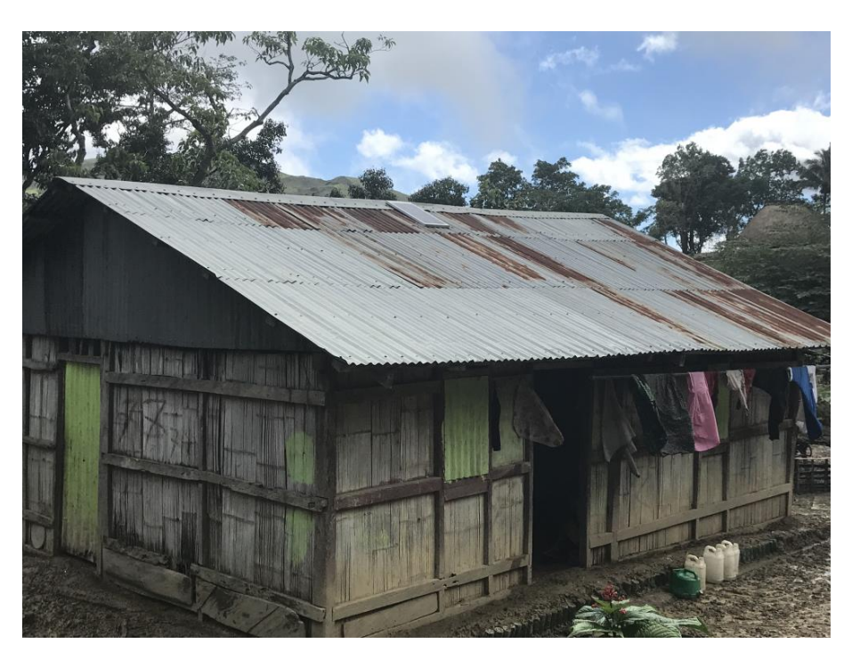
A small solar panel has been installed on this house roof as part of the VLS program in Halik Nai