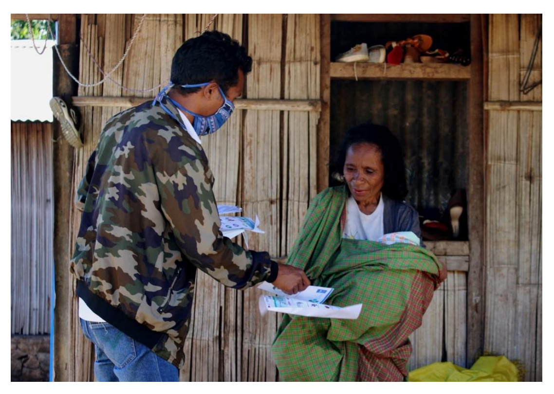
CCC staff distributing information on Coronavirus in a village in Fatalulic sub-district

Many programs and activities were disrupted from March until June 2020 due to the global COVID-19 pandemic and restrictions imposed due to the State of Emergency declared by government during these months. All CCC partners and donors were flexible during this time and were able to reallocate program funds for COVID-19 related activities. This allowed the CCC to respond quickly to assist communities during this time.