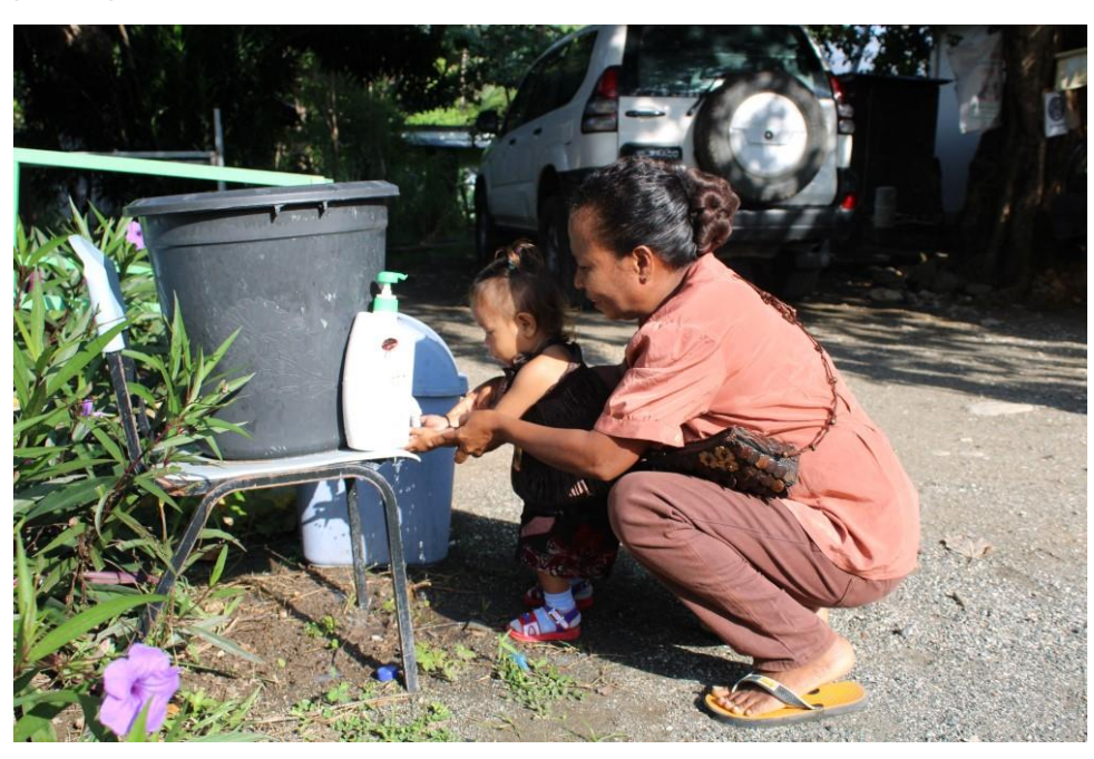
Handwashing training starts early at the CCC

The CCC team were formally invited to participate in the District COVID-19 Taskforce. This was great recognition for the CCC on their proactive response to the pandemic and their capacity and drive to support their community. As part of this taskforce, the CCC staff were able to travel freely throughout the district and worked in collaboration with other local NGOs and government departments. One of the shared activities was to install plastic water tanks for handwashing in public places around Suai.