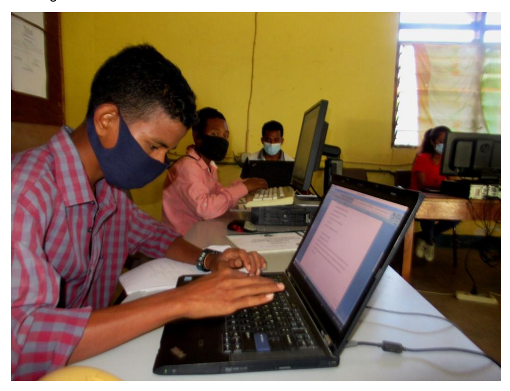
Many young people attend computer training at the CCC

Training completion numbers have been lower than expected because of disruptions caused by the global pandemic and State of Emergency. The team is anticipating increased numbers in the coming months.