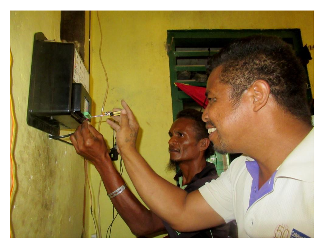
Local technicians are trained to maintain and repair the VLS equipment

The installation of solar panels provides lighting in the evening and removes the need to purchase and use kerosene, bringing social, economic and health benefits to families.