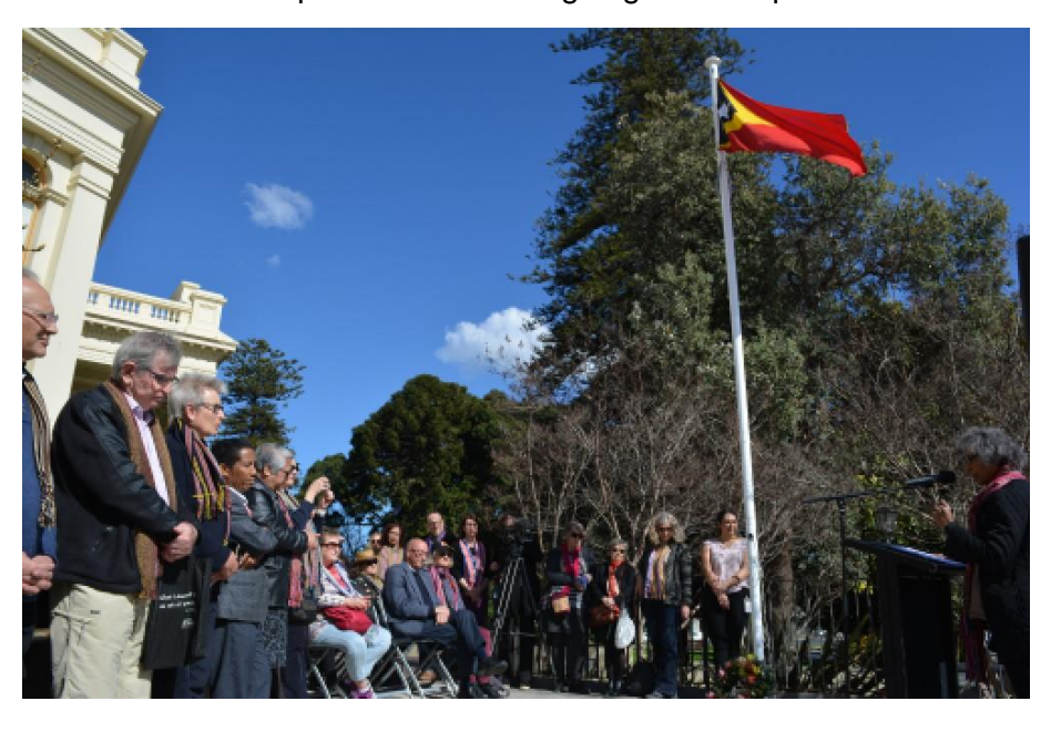
Flag raising ceremony at St Kilda Town Hall

More than 30 people attended the event including City of Port Phillip Councillors and staff. It was a moving ceremony, with passionate speakers sharing their very personal and moving stories and words about the importance of our ongoing friendship.