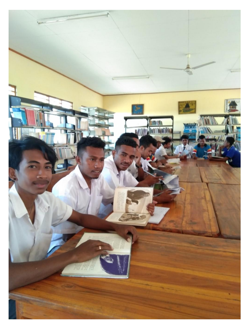
Students reading bookings in the Suai Secondary School library

A small library at the CCC contains books, cassettes, DVDs and games. Most of these resources are in English and are used by the English teachers during training, and also accessed by CCC staff.