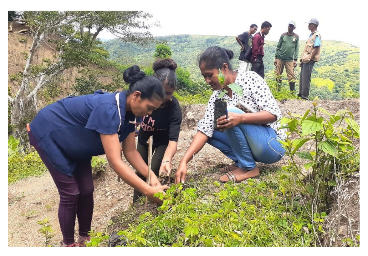
Planting trees is an activity in the Disaster Risk Reduction program at the CCC

The staff involved in these programs were also involved in establishing a national association for DRR and actively participate in this network to share challenges and achievements.