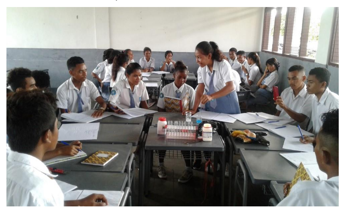
Students using the science equipment donated by FoSC

The Knua Pratika (KP) group borrow the science equipment from the Suai Secondary school library and have provided training to an enthusiastic student group called EPHA. In celebration of the International Day of Science and Mathematics, seven teachers from the KP group and 14 students from EPHA participated in a national science fair in Same district. Science equipment was borrowed from the library for these activities.