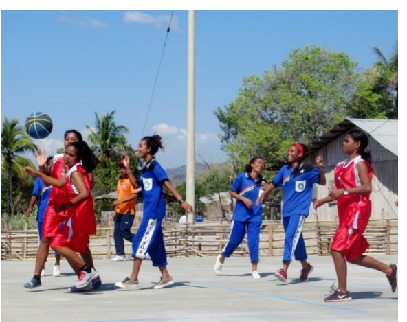
Students at Suai Secondary school enjoying a game of basketball on the new court