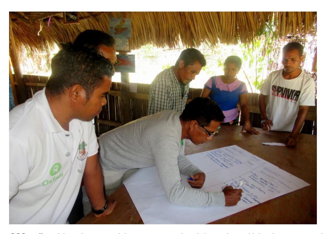
CCC staff participate in many training programs and workshops along with local partner organisations

Once endorsed, the 2020-25 plan will be made public and will guide the work of the FoSC. Later in 2020, the CCC team will commence the process of reviewing and updating their strategic plan.