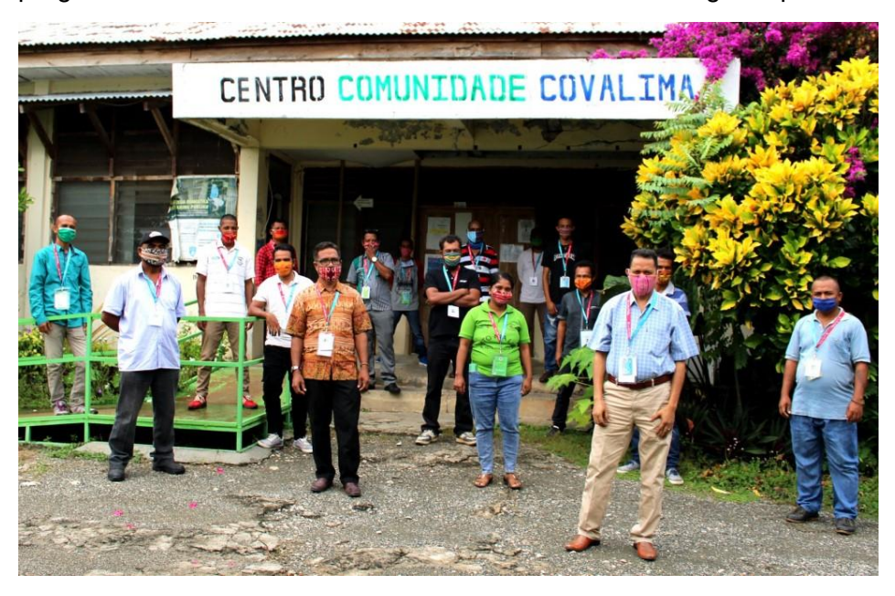
The CCC team demonstrating social distancing at the Centre

This report includes an overview of all CCC activities in order to demonstrate the breadth of programs at the CCC and includes reference to the funding and partners involved.