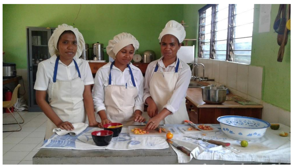
Scholarship recipients studying a Certificate 2 in Hospitality at the local vocational school in Suai.

There are 22 FoSC scholarship recipients in 2020. This cohort includes 16 young women and six young men, with 16 continuing from 2019 and six new places offered to study primary school teaching, hospitality and general construction.