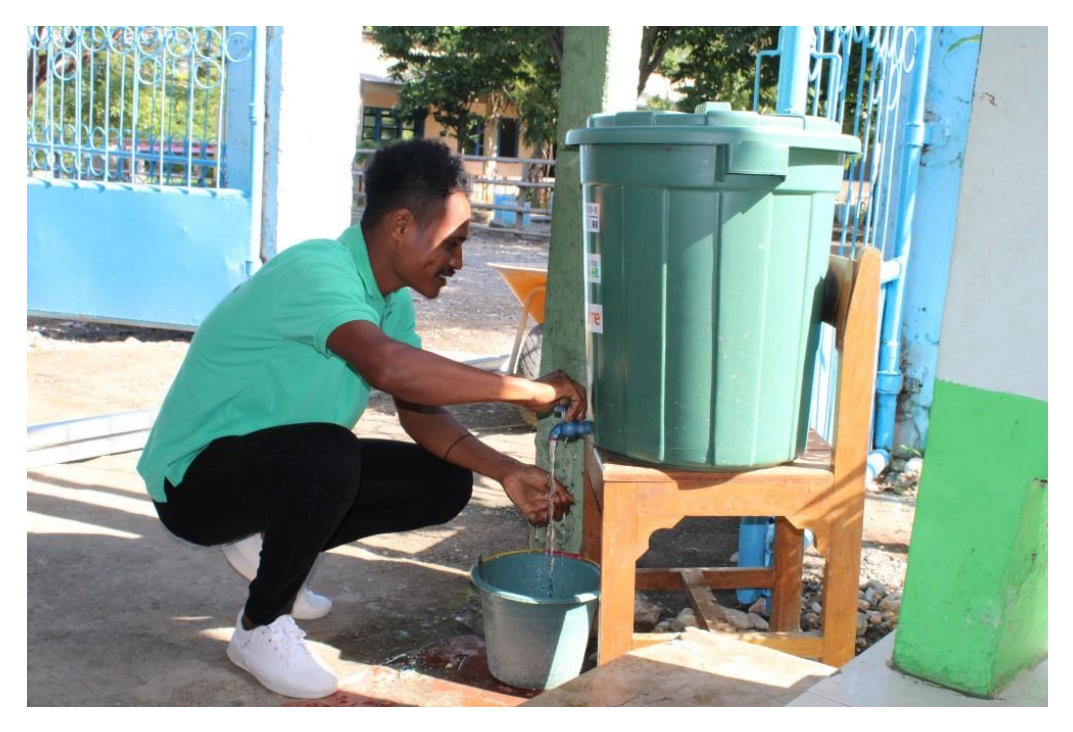
CVTC Suai, the local vocational school, reopened after implementing COVID-safe practices