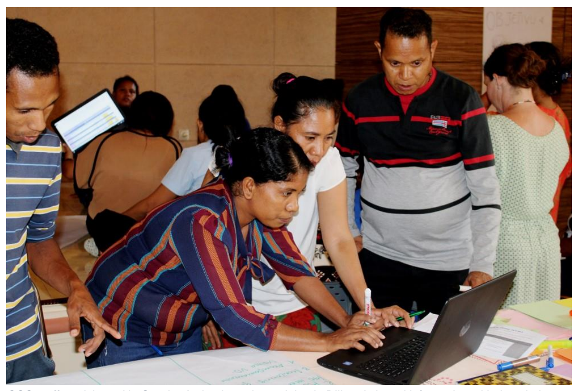
CCC staff participated in Gender Action Learning training in Dili and shared information with the whole team