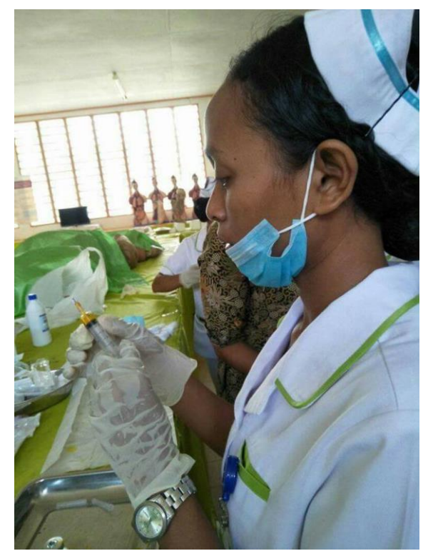
Scholarship students practising their skills in general construction (left) and nursing (right)