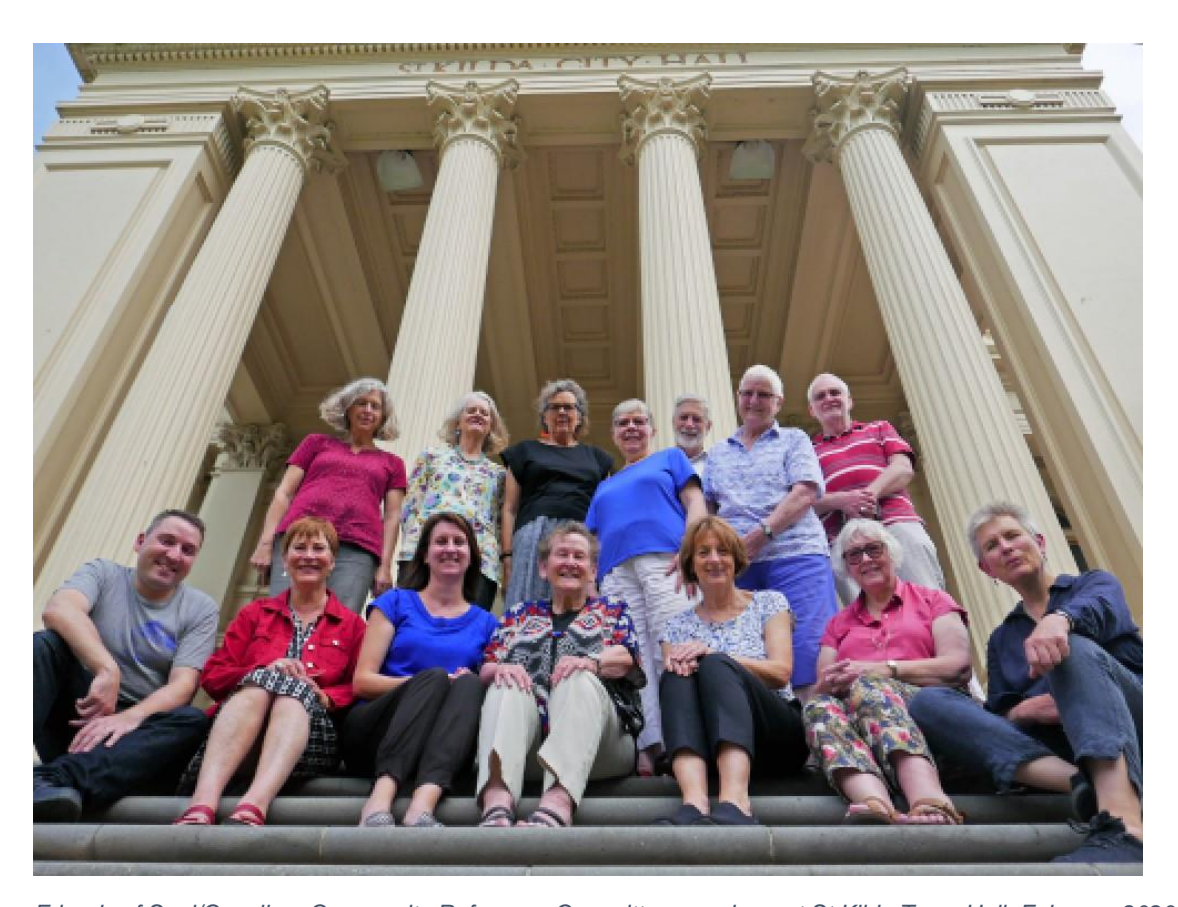
Friends of Suai/Covalima Community Reference Committee members at St Kilda Town Hall, February 2020

Chair, Friends of Suai//Covalima Community Reference Committee