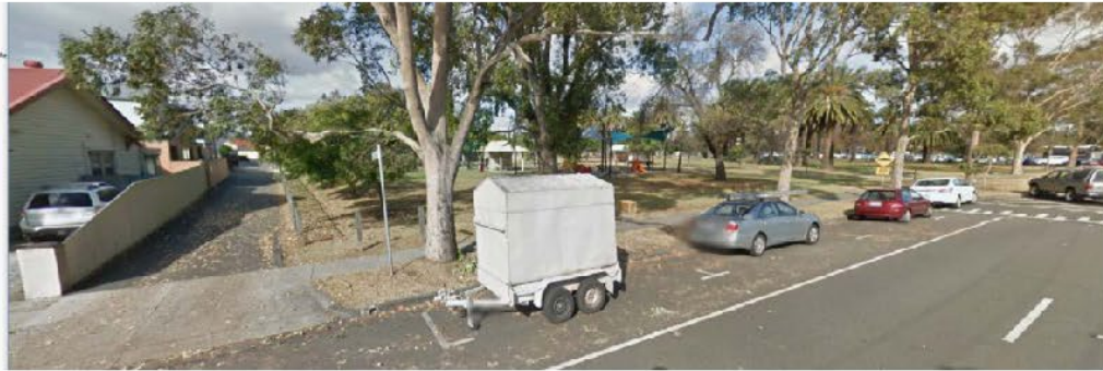
Government Road and Edwards Park to the south of the site.