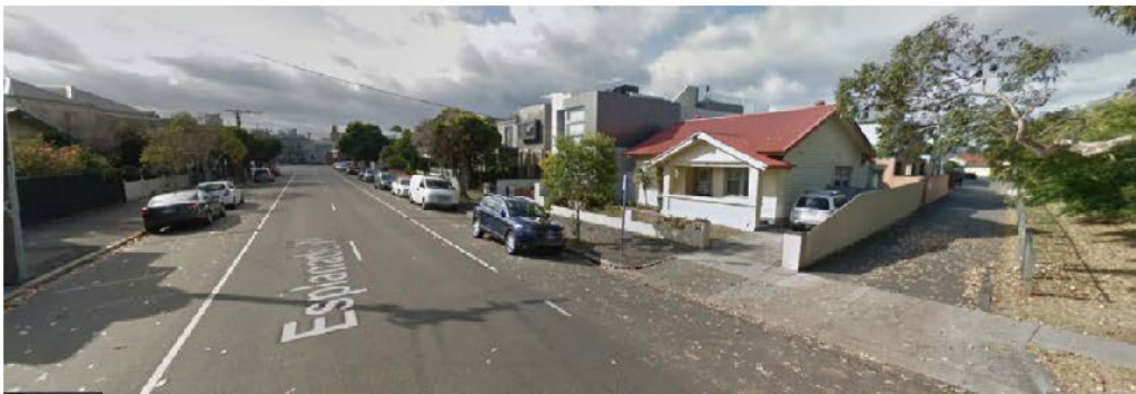
Subject site and properties to the north