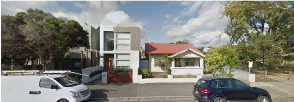
Subject site and Nos. 220 and 222 Esplanade West