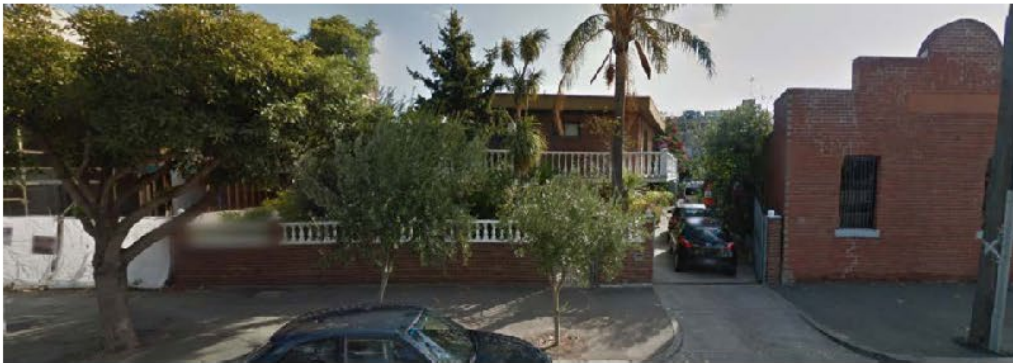
No. 211 Esplanade West to the west of the site