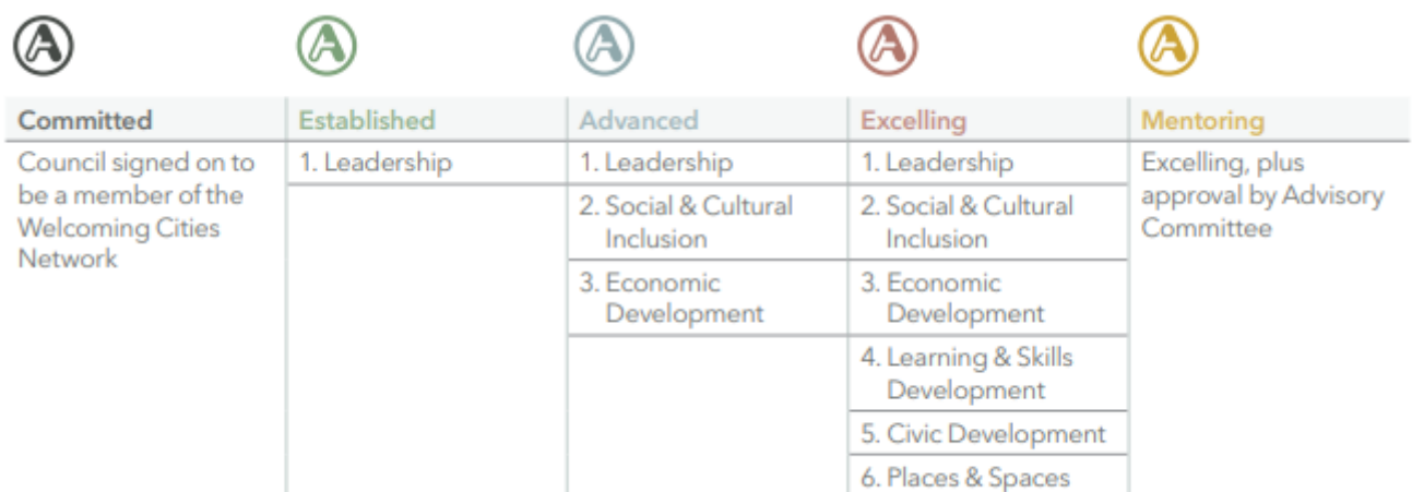
Figure 5: Welcoming Cities categories.

Figure 8 indicates the categories to be addressed at each level of accreditation. Council is a “committed” member. The subcommittee has been investigating opportunities for future advice to Council in working towards become an “established” member.