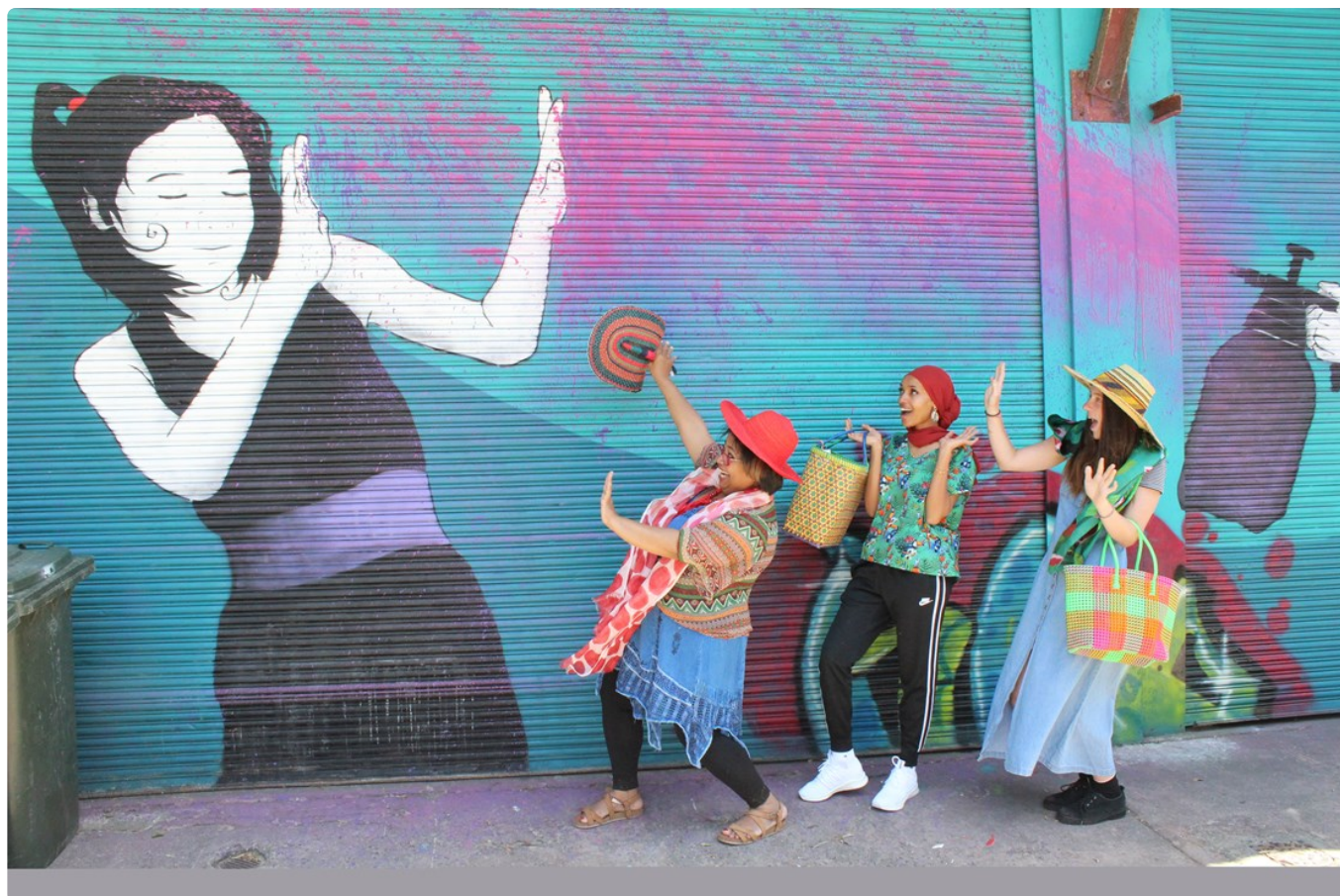
Space2b, Laneway Festival 2019.

Our Local Festivals Fund encourages and supports not-for-profit organisations and community groups to develop small to medium-scale local festivals or events for