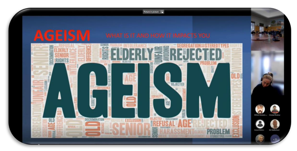
Pictured: Ageism Awareness Information Session hybrid, July 2022.