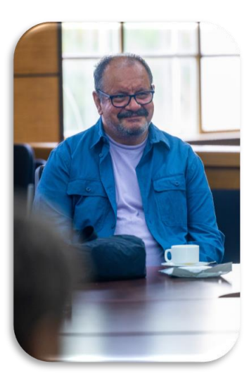
Pictured: OPAC Meeting December 2022.