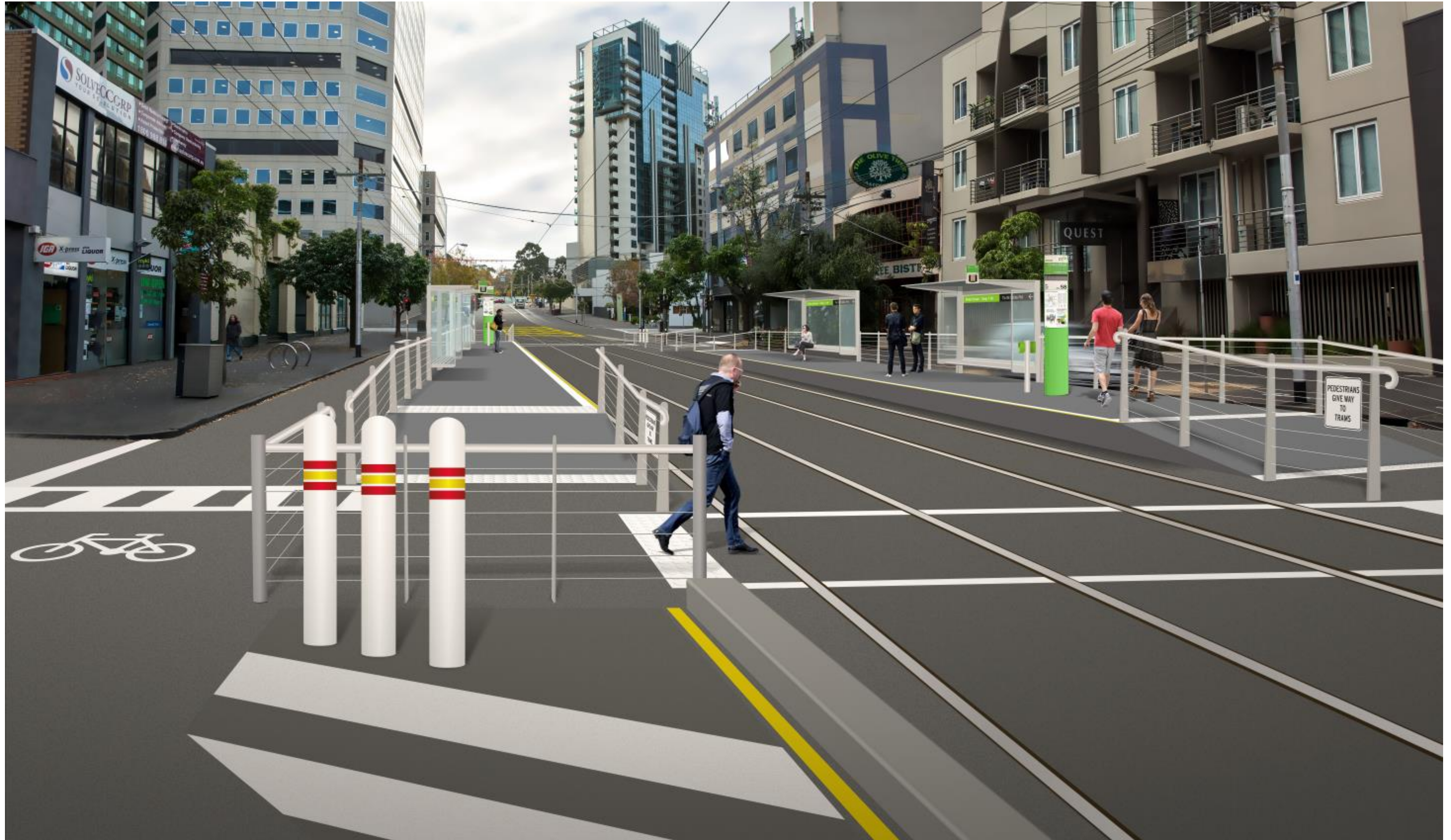
Figure 4.2: Park Street tram stop – view east towards St Kilda Road