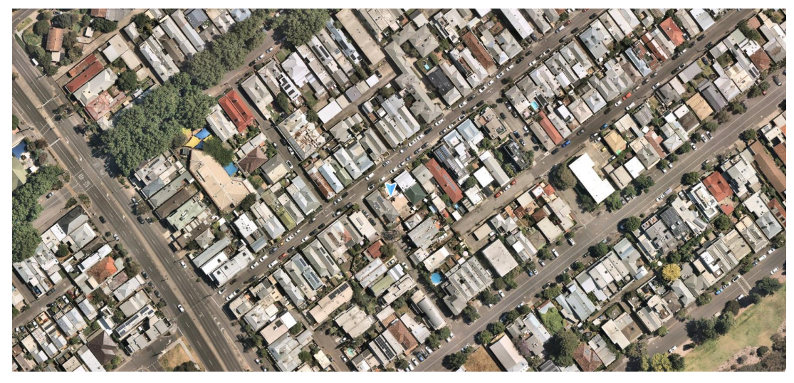
Image 9: Aerial photo of the wider neighbourhood.