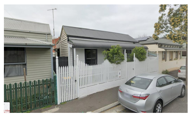
Image 1: Photo of the demolished dwelling from the delegate report for 43/2021.