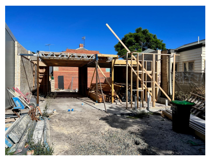
Image 4: 126 Albert Street, site of demolished dwelling.