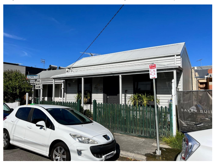
Image\ 5:\ 130\ Albert\ Street,\ adjacent\ neighbouring\ dwelling\ to\ the\ east.\ Source:\ M.\ Cooksley,\ 2023.