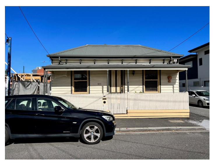
Image 6: 122 Albert Street, adjacent neighbouring dwelling to the west.