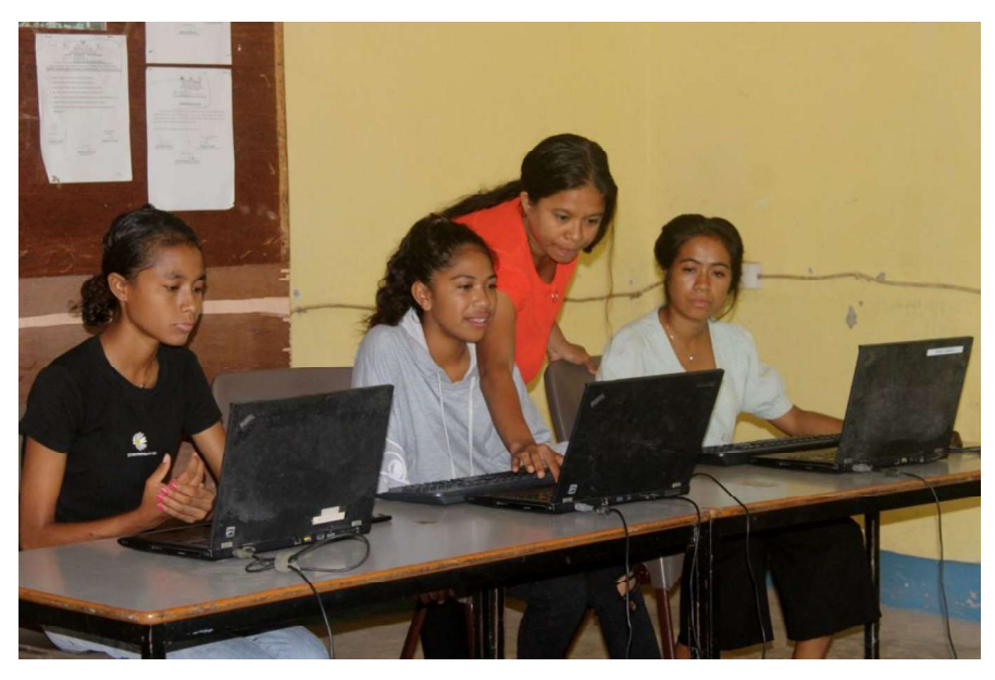
CoPP superseded laptops are used to deliver community training at the CCC

Access to computers and training ensures community members can develop skills for employment and education purposes and improved access to information.