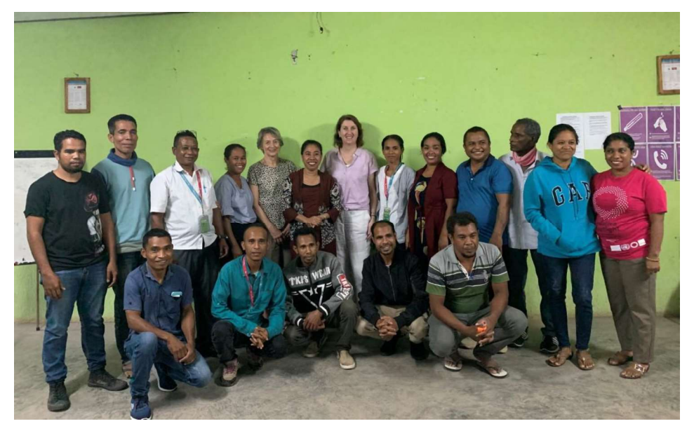
CCC Commission and staff meeting on 30 June

A meeting was held with the CCC Commission and staff to clearly outline the changes to funding arrangements over the next four years, including the reduced role of the FoSC Coordinator.