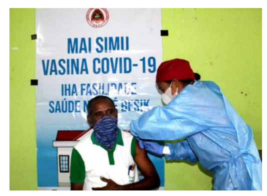
Staff received vaccines at a clinic set up at the CCC in August 2021

The CCC training room was used as a vaccination clinic on multiple occasions and the CCC vehicle was used to provide transport for community members who needed support to reach health clinics.