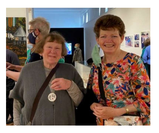
Many FoSC supporters and Port Phillip residents and artists enjoyed the exhibition