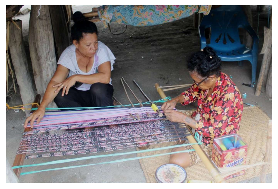
A member of the Fitun Naroman (Bright Star) group weaving a traditional tais

The CCC is nationally renowned for their work to support women's leadership, gender equality and raise awareness about gender based violence. They are actively involved in many networks and meetings with local and national government, NGOs and CSOs.