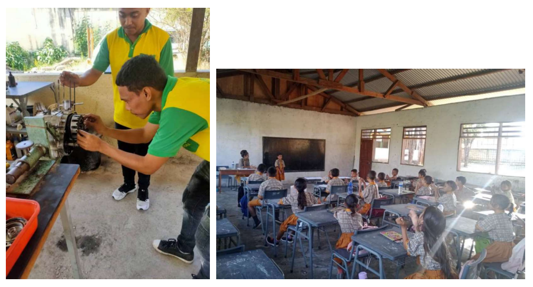
Left: One student is training to be a motorbike mechanic at Senai Becora and gaining lots of practical experience; Right: A student at Baucau Teachers College is completing her final three month placement at Debos Primary school in Suai