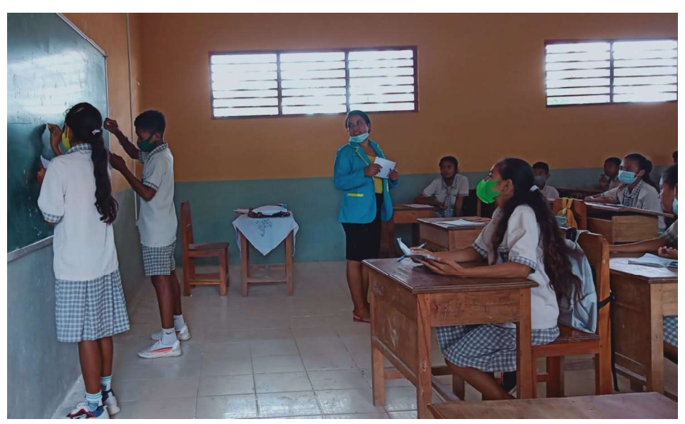
Students at Baucau Teachers College do a three month practical placement in their final year

Scholarships are funded through FoSC fundraising activities and community donations, and the Education Program Coordinator at the CCC organises the registration and enrolment processes and provides pastoral care. The Program Coordinator remains in contact with all students and training institutes, to ensure the welfare of students and provide encouragement throughout their studies.