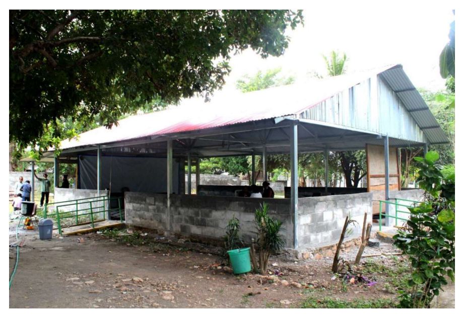
The CCC training room was rebuilt due to flood damage and is now hired regularly by community groups.

An outline of the programs implemented at the CCC this year, and their funding partners, is included in this section.