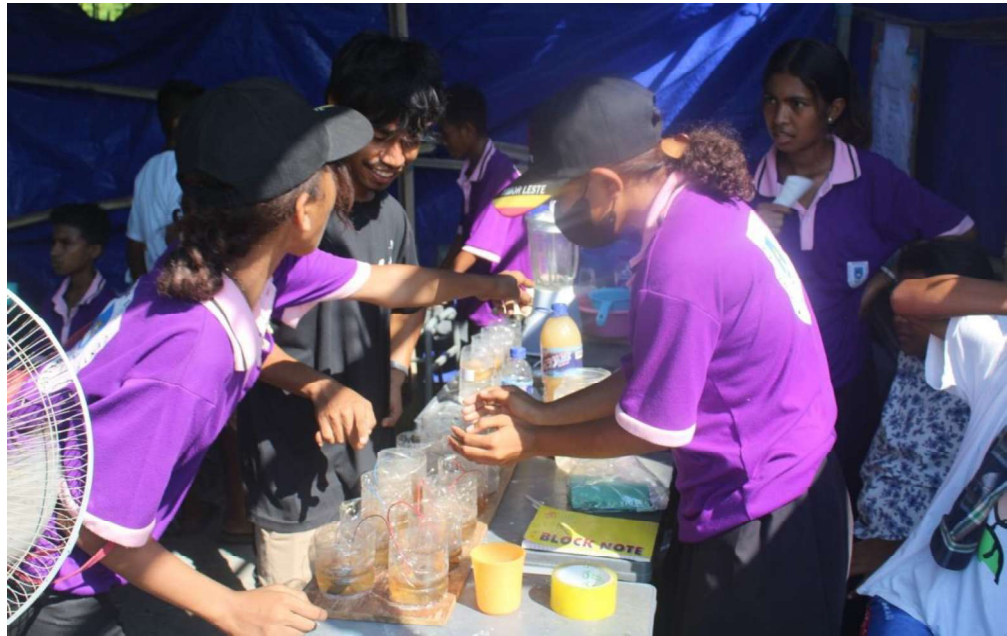
Student demonstrating science experiments at the community event in Suai in Suai

Many students and community leaders provided feedback that this was a great initiative and experience for students and encouraged FoSC's continuing support for these activities.