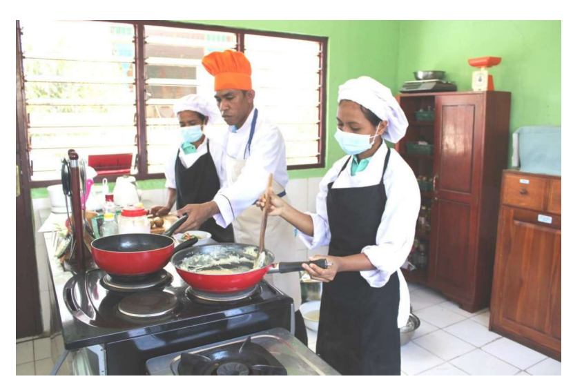
Students at the Canossian Vocational Training Centre in Suai which has great facilities for hospitality students