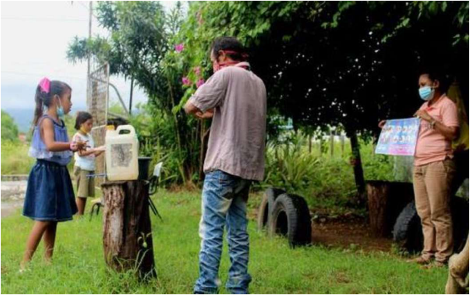
Students at CCC learning about the importance of handwashing training

Costs for the training are minimal and are funded through the Civic Health Fund established with funds by FoSC since June 2020.