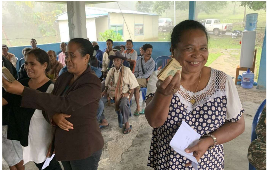
Annual payments were made to landholders at an official ceremony in Lalawa in June 2022.