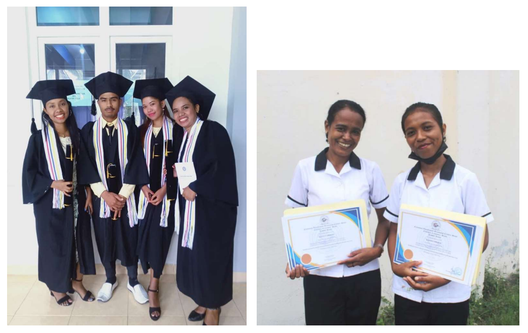
Left: Four students graduating from Baucau Teachers College; Right: Graduates from CVTC Suai graduated in December 2021 with a Certificate 2 in Hospitality