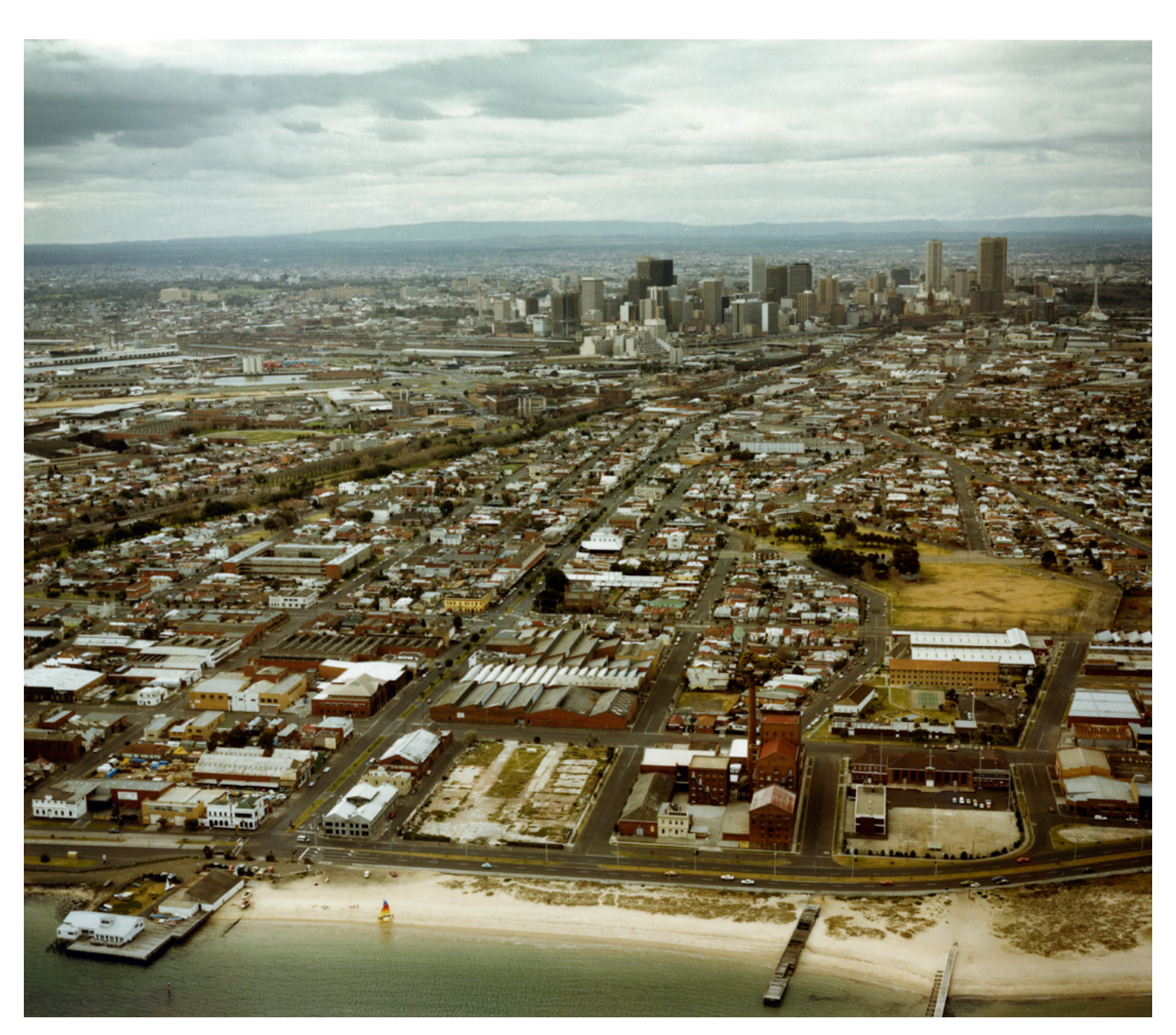
Aerial view of Port Melbourne looking north east towards Melbourne, 1983

Port Phillip Writes Stories and Poems celebrating 18 years of publication