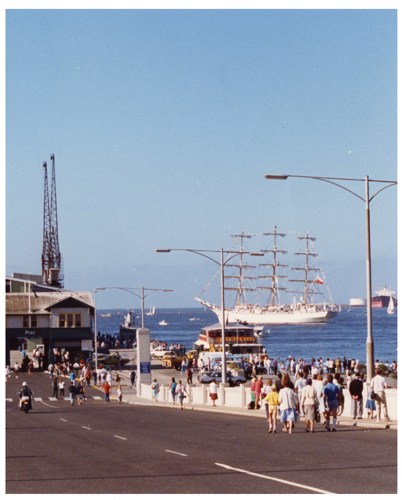
Tall Ship "Dar Mlodziezy" leaving from Princes Pier, 1988