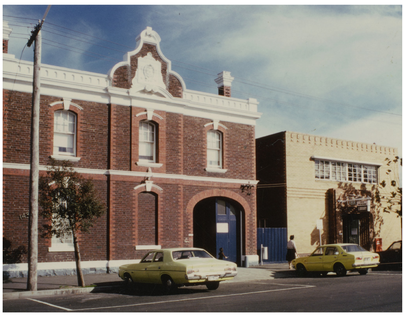
Former Port Melbourne Fire Station, 1979, Port Phillip Collection