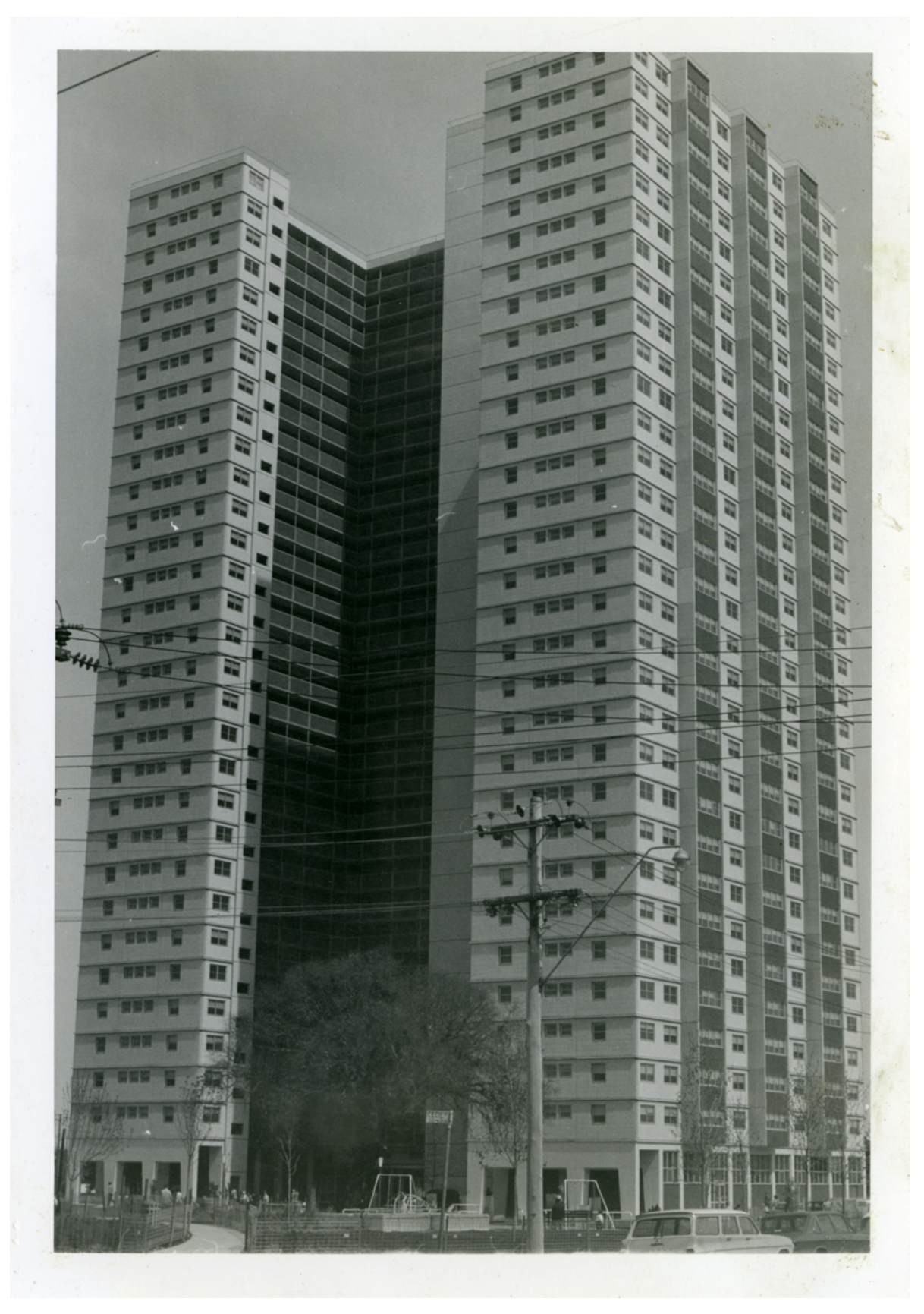
Park Towers Housing Estate, South Melbourne, 1969