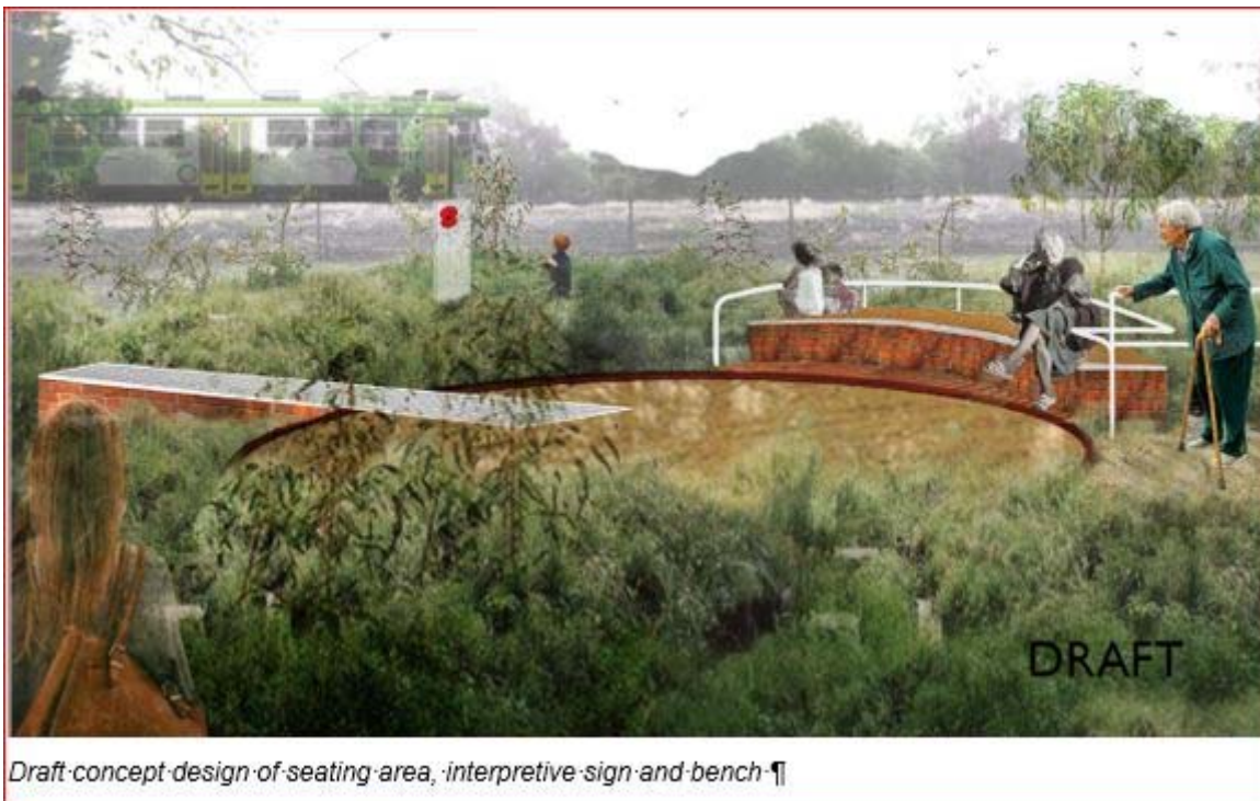
Draft concept design of seating area, interpretive sign and bench