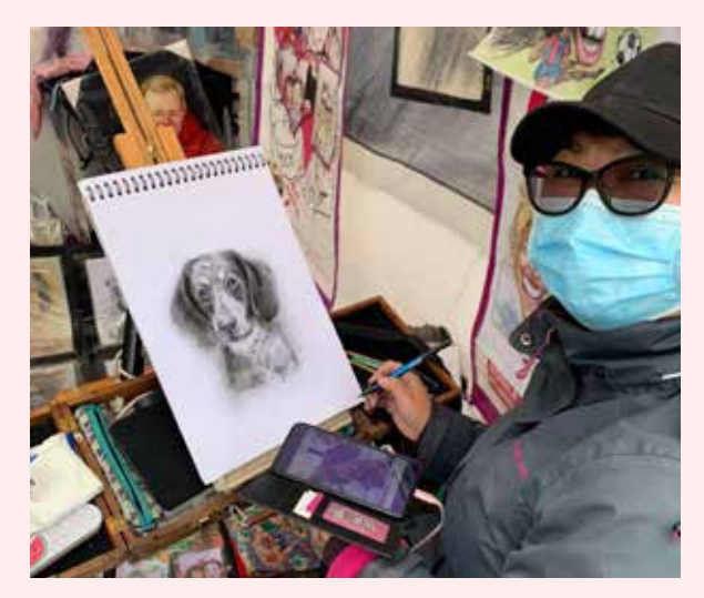
Artist stallholder at the Market