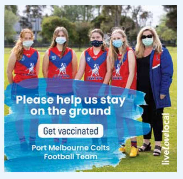
COVID-19 vaccination campaign was to encourage our community to book their appointments.

"Luna Park cannot do takeaway rides on the Great Scenic Railway, and we can't 'click and collect' the dodgem cars. Birthday parties, events, celebrations, music, thrills, laughter and fairy floss are waiting and so close. We want you back Melbourne. We want all of Victoria back."