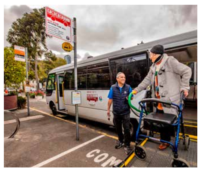
Popular destinations for the community bus include South Melbourne Market, libraries, shopping precincts and medical services.