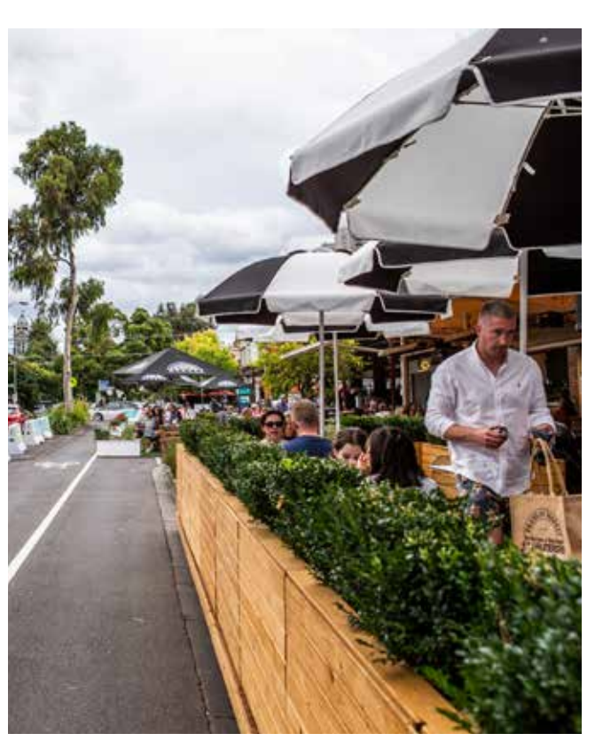
Outdoor dining precinct along Cecil Street.