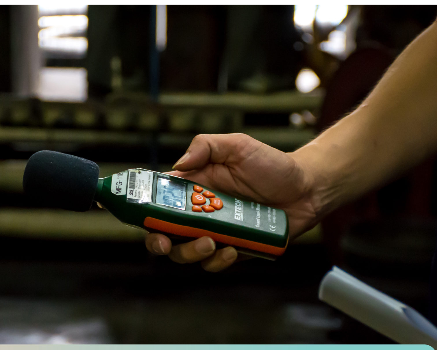
Regulations & Registrations | Seeking professional advice on acoustics