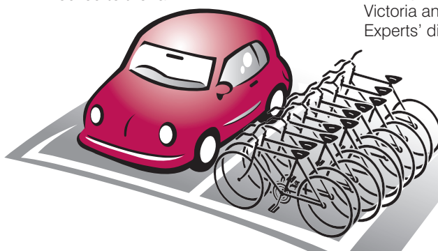
One car space can usually be converted to 10 to 14 bike parking spaces.

In recent years, the bicycle industry has developed a wide range of parking solutions addressing product selection criteria, such as space availability, user preferences and security requirements. The table below provides an overview of the most common bicycle parking systems. For further details, we recommend referring to the 'Bicycle Parking Handbook' from Bicycle Network Victoria and talking to their 'Bike Parking Experts' division