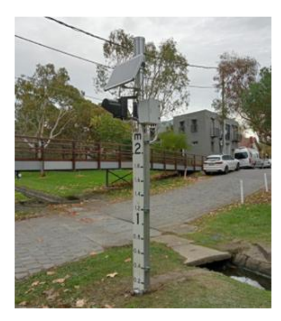
Flood forewarning in Foam Street

The newly installed flood warning system delivers the community benefits of improved warning response times during flood events and reduced public health and safety risks.