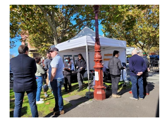
Pop-up conversation in Middle Park

A big thank you to everyone who participated in the pop-up. Your feedback is hugely important in ensuring that the work we do meets community need and expectations.