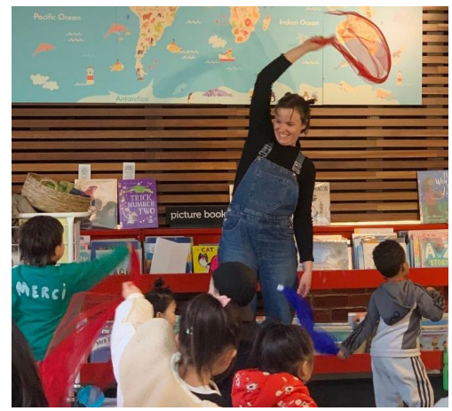
Smiles at Sensitive Storytime

As with all our Storytime sessions, there will be plenty of books to be read and songs to dance and sing-along to!