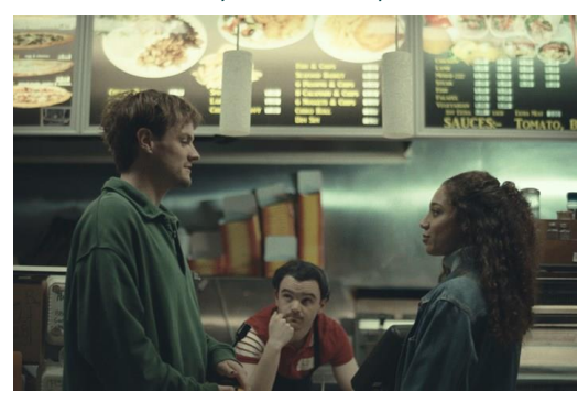
Two of a Kind: Tandem Tales