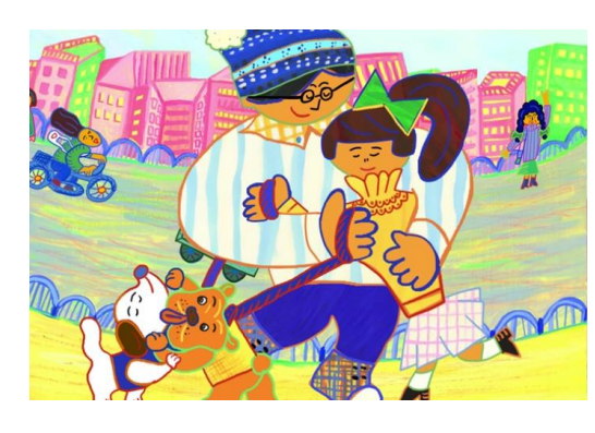
International Family Animation Explosion #2