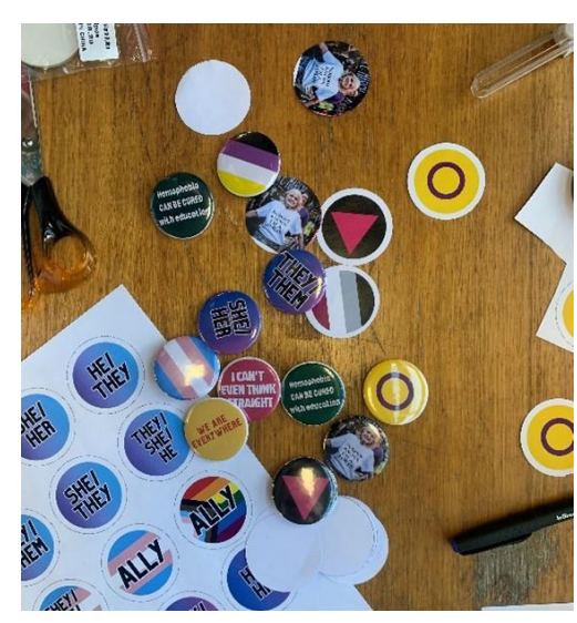
A badge of pride at St Kilda Library

with our staff!), and a wonderful opportunity for education and discussion about different LGBTQIA+ identities.