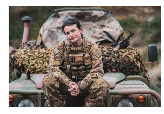
Shifting the Gaze