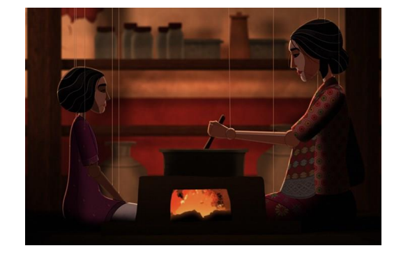
Australian Animation Showcase