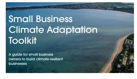
SECCA climate adaptation toolkit

City of Port Phillip is a member of SECCCA.