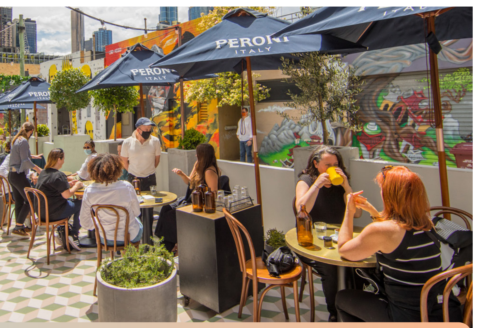
Liquor Licensing & Food Registration | How to apply for a Liquor Licence

If you have any questions about applying for a liquor licence, visit <u>www.vgccc.vic.gov.au/</u>