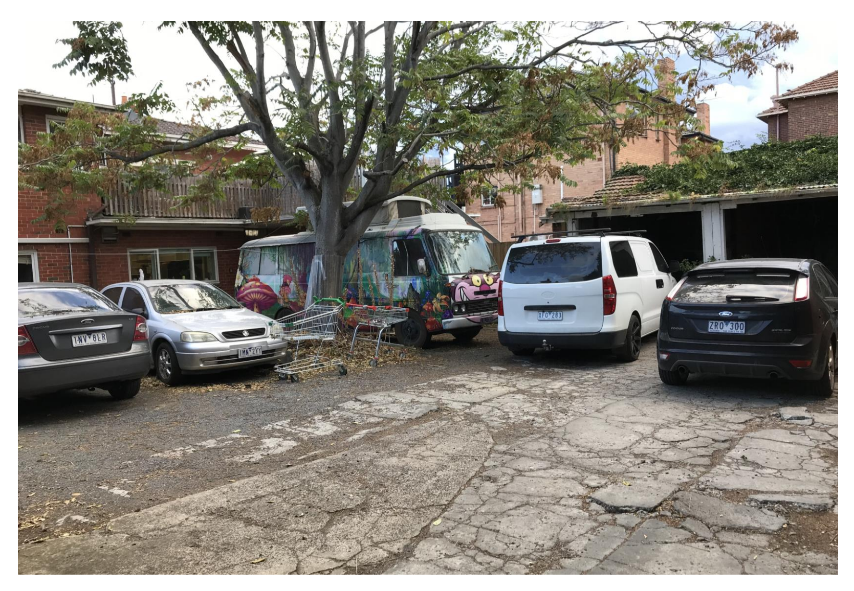
Image 1: Photo of car parking layout at the rear of 332 Carlisle Street, Balaclava.