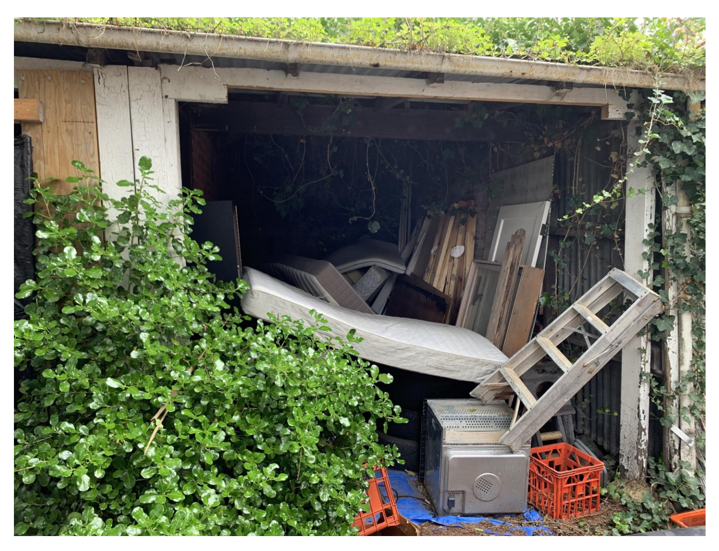
Image 8: Garages to the rear of the building.