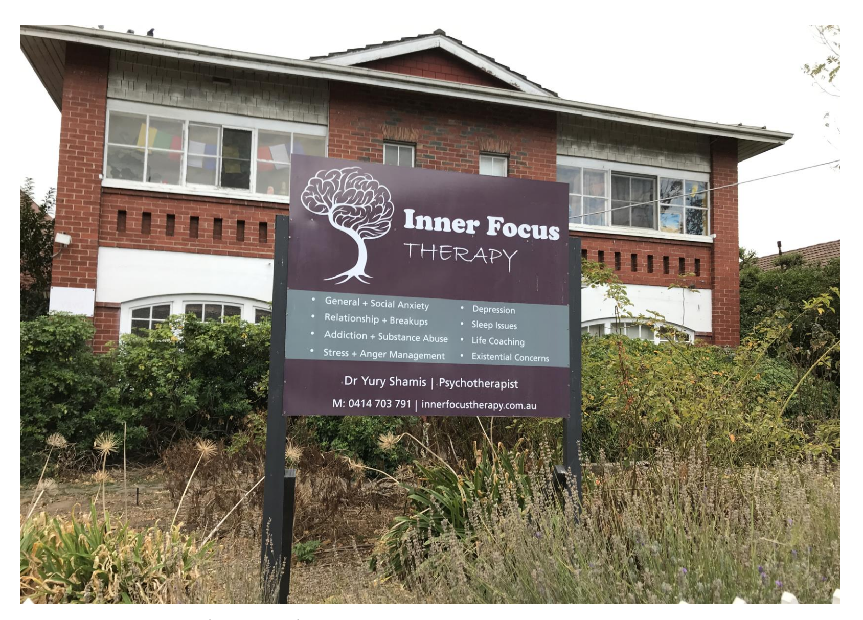
Image 4: Sign proposed to the front garden of 332 Carlisle Street, Balaclava.