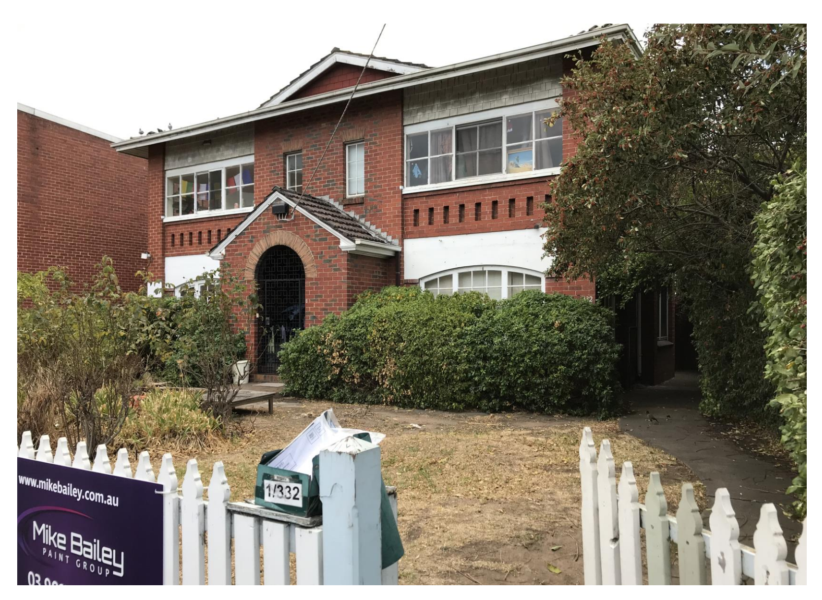
Image 2: 332 Carlisle Street, Balaclava from the front.