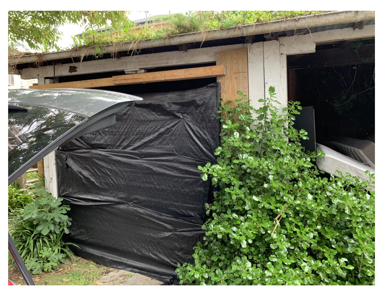
Image 9: Garages to the rear of the building.