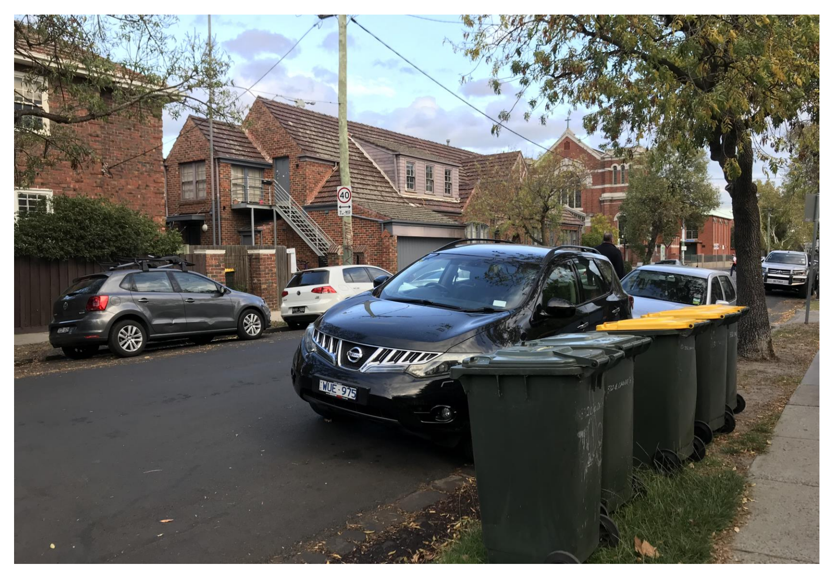
Image 3: on-street parking on Orange Grove, near the intersection of Carlisle Street.