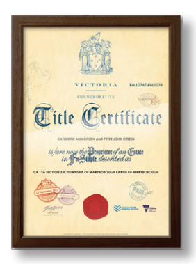
Certificate of Title