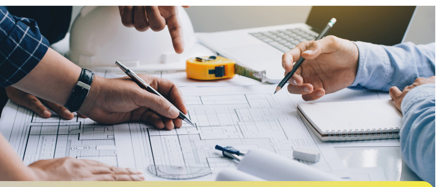
Planning | How to apply for a planning permit