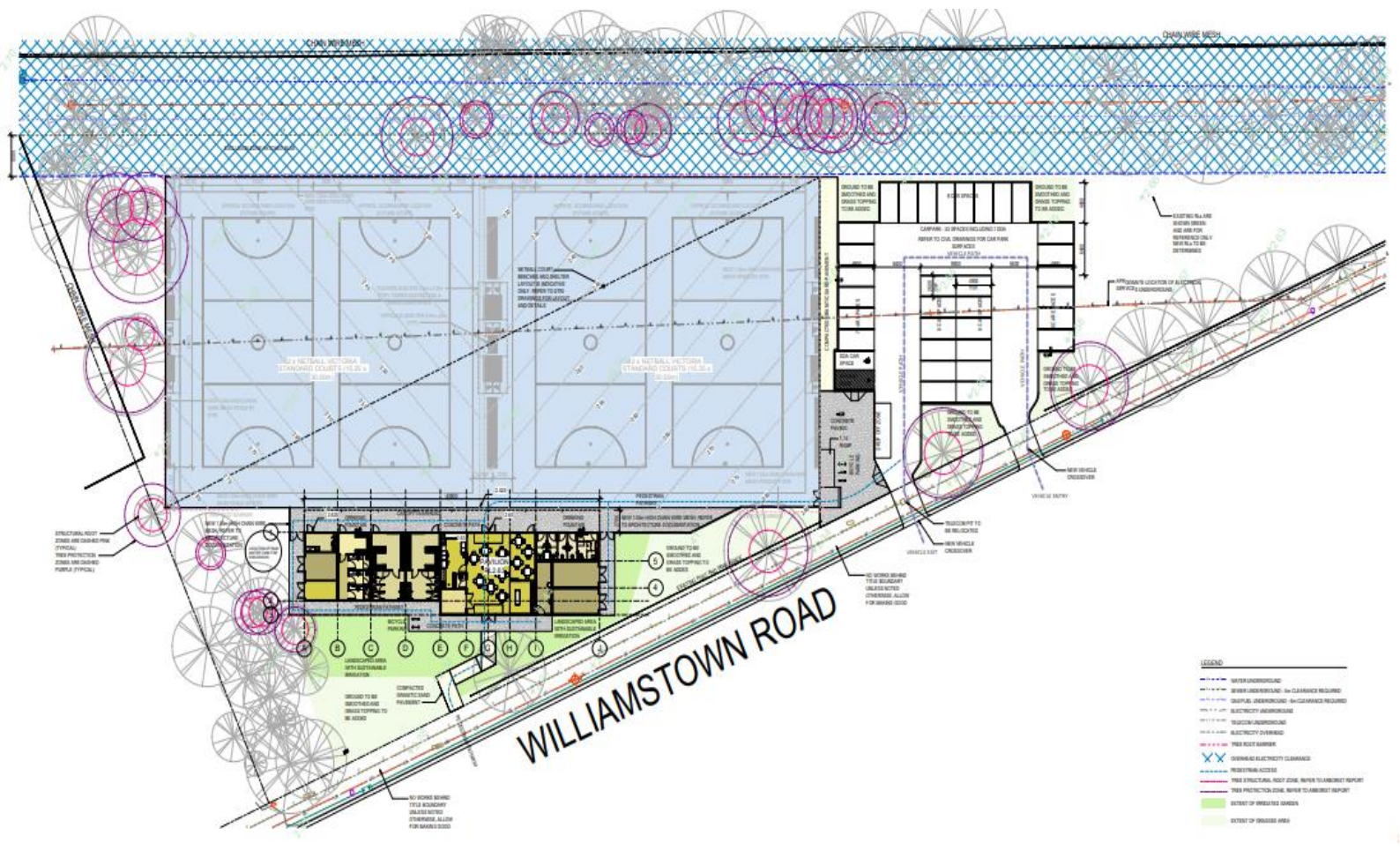
Image 2: Site layout showing location of courts, pavilion and carparking.