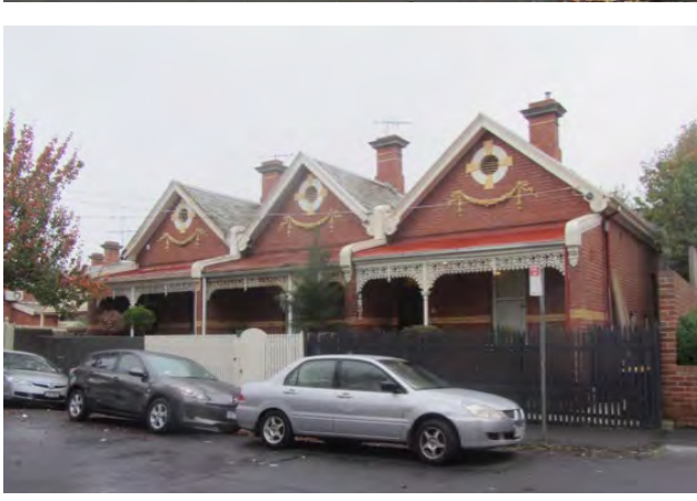
Houses 2-6 Blanche Street, St Kilda