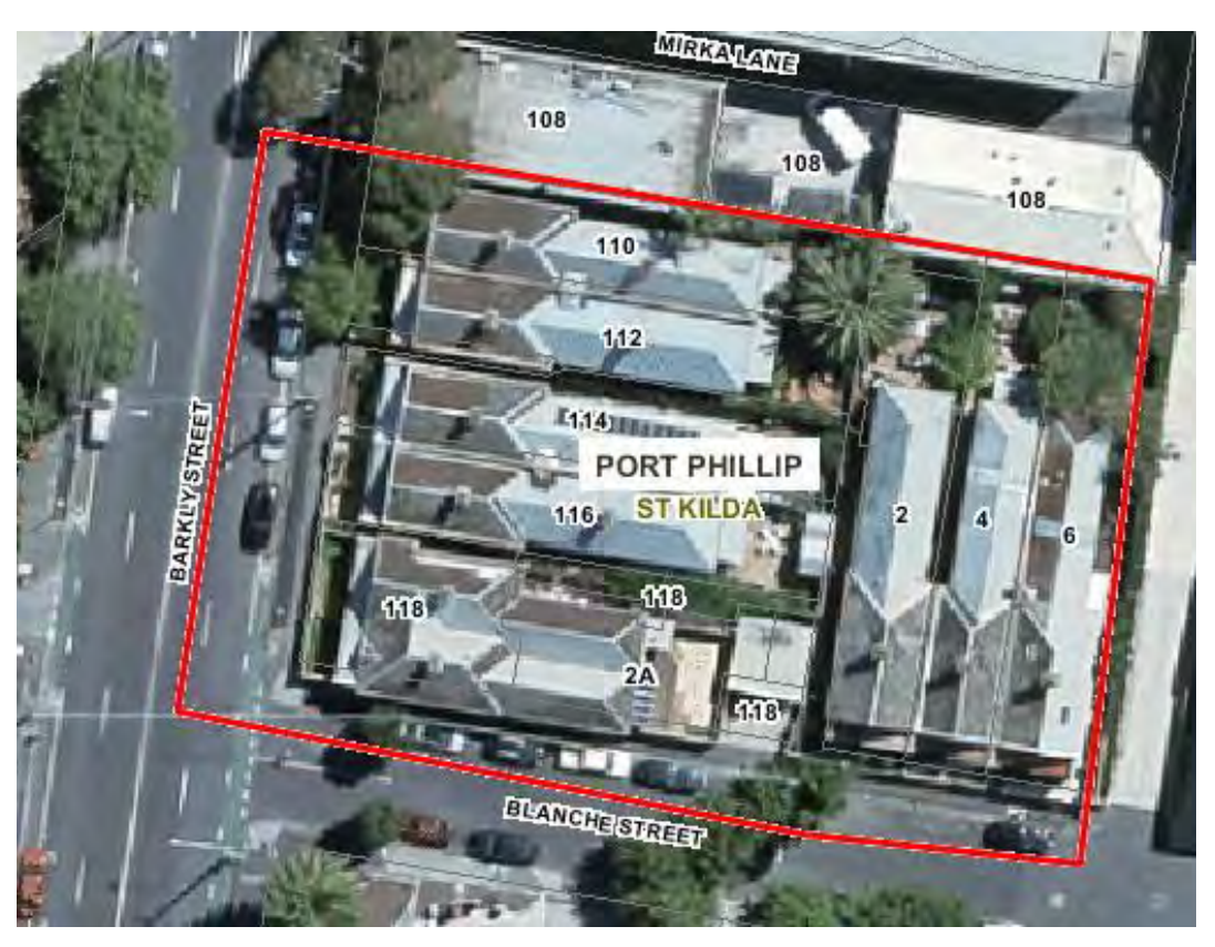
Figure 14 Proposed HO curtilage overlaid on aerial image