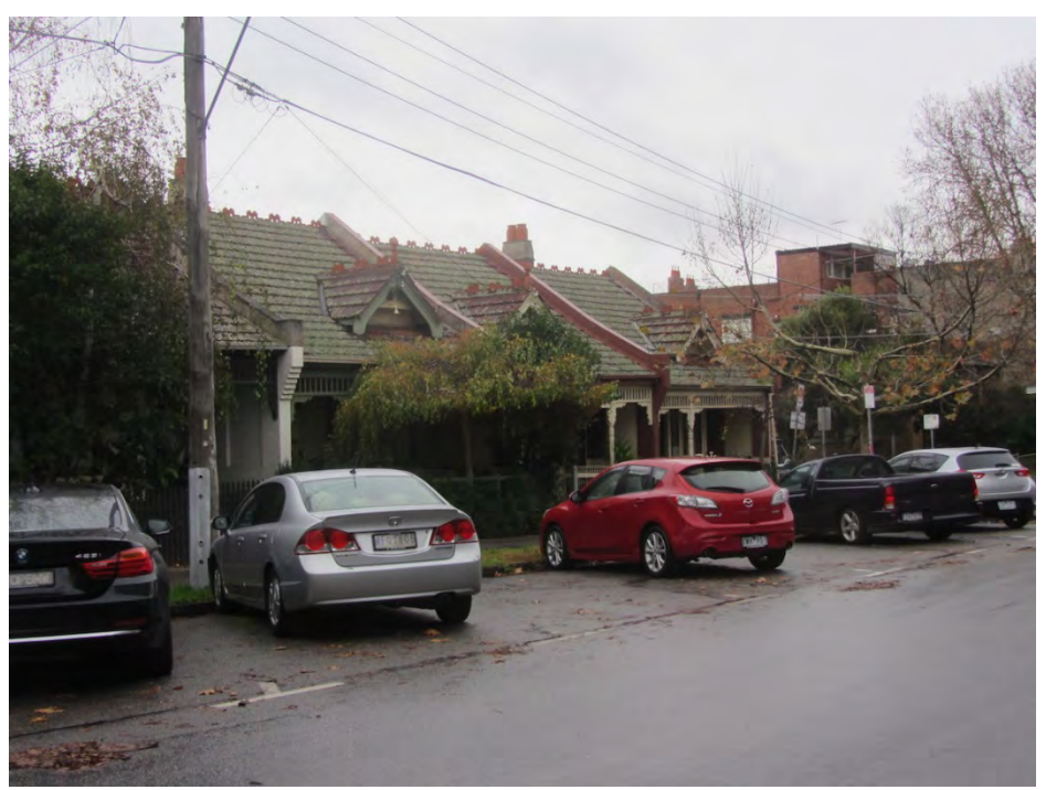
Figure 7. Single terrace row of Edwardian houses c.1910 at 30-44 Acland Street, St Kilda, and located in the St Kilda Hill Precinct (HO5). Note the traditional forms and detailing.

While there are similar examples of groups of Federation/Edwardian houses constructed by a single builder in St Kilda within the St Kilda Hill precinct (HO5), such as those at 30-44 Acland Street (see figure 7), 3-9 and 4-12 Emilton Street (see figure 8), they are all of a much more conventional Federation/Edwardian design idiom, with terra cotta tile roofs with cresting.