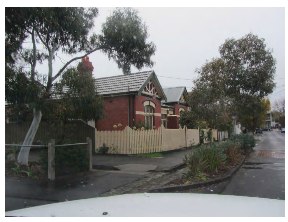
Figure 9. 68-74 Octavia Street, showing two pairs of houses (constructed along with several pairs and one freestanding house in adjacent Moodie Place [around the corner]).