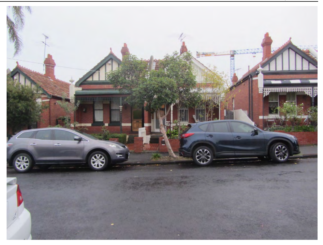
Figure 12. Detail of houses in Lambeth Place.