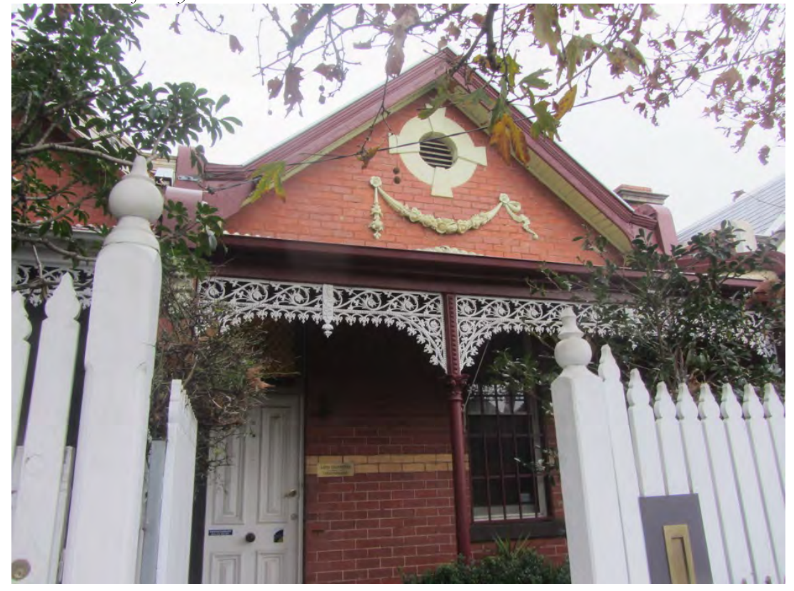
Figure 2. Showing decorative detailing common to 110-112 Barkly Street and 2-6 Blanche Street (oculi and swagged garlands on gable end, verandah posts and cast iron frieze, cream brick banding).