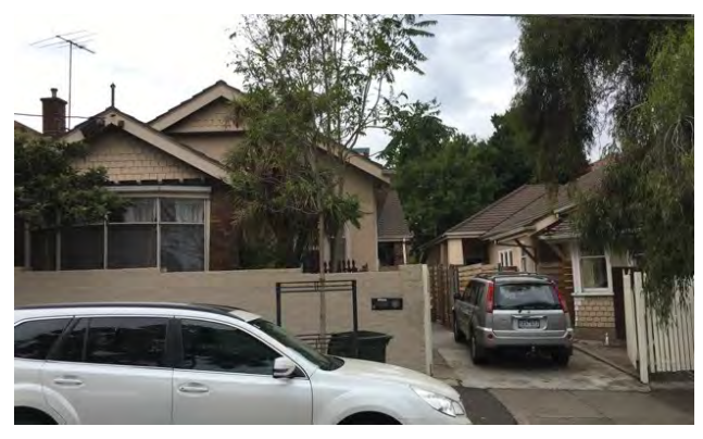
Greycourt, 96 Grey Street