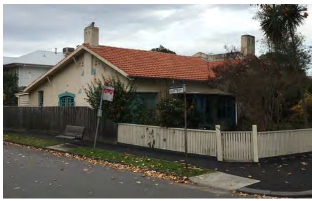
Houses, 152 & 154 Mitford Street