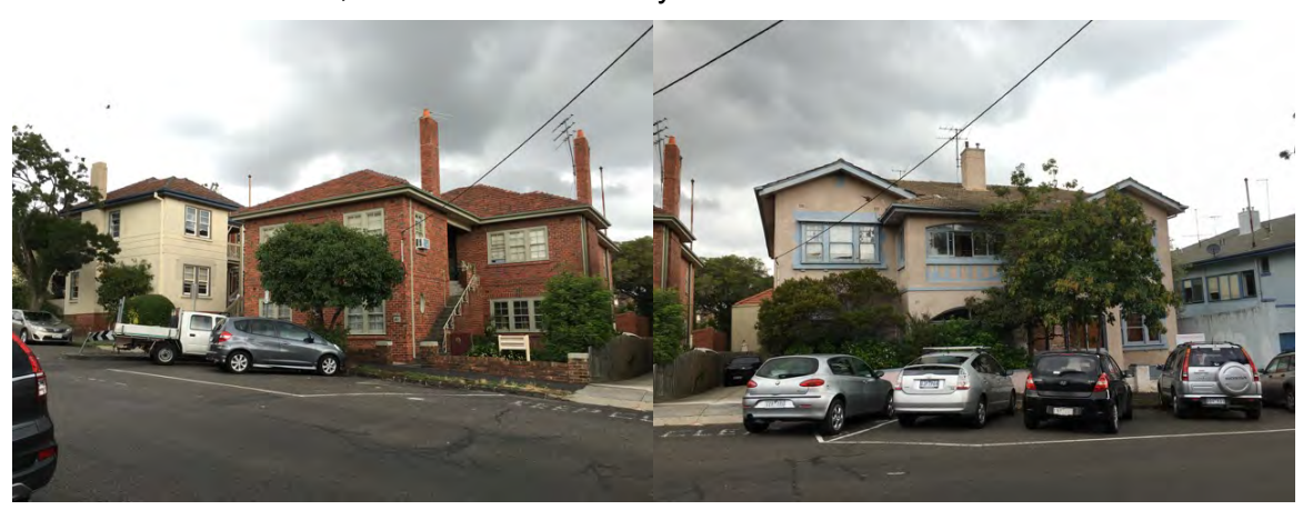
Figure 1 At left are 39 Mitford Street (pale rendered building) and 41A Dickens Street (red brick), within HO7, while at right is no.41 Dickens Street, outside HO7