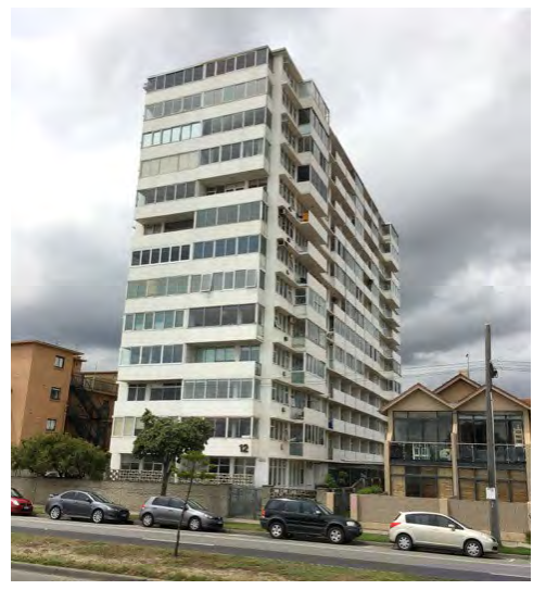
Edgewater Towers, 12 Marine Parade