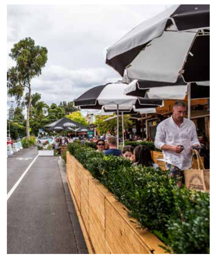
Outdoor dining precinct along Cecil Street.