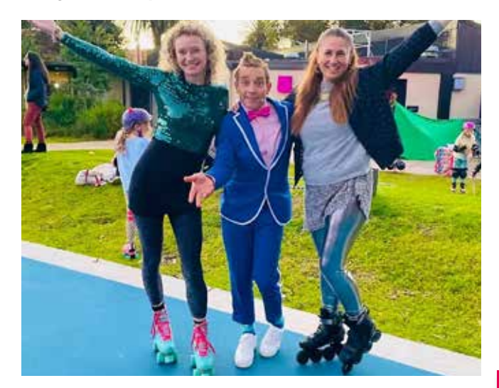
Peanut Butter Roller Jam events to be held between November 2021 and May 2022

Find out more about the successful grant recipients