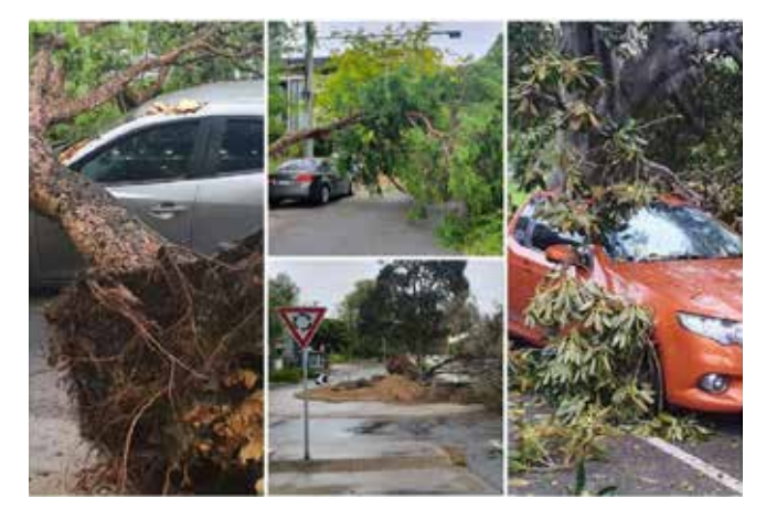
In total, Council, alongside their contractor Citywide, removed more than 30 trees across the municipality, and responded to 294 storm-related requests.

The felled branches and trees were photographed and reported to coordinate our response. We provided traffic management across key areas where trees and branches blocked primary roads was provided, and subsequently engaged with local Police, to locate drivers of vehicles that had sustained heavy damage, or were located in high risk areas.