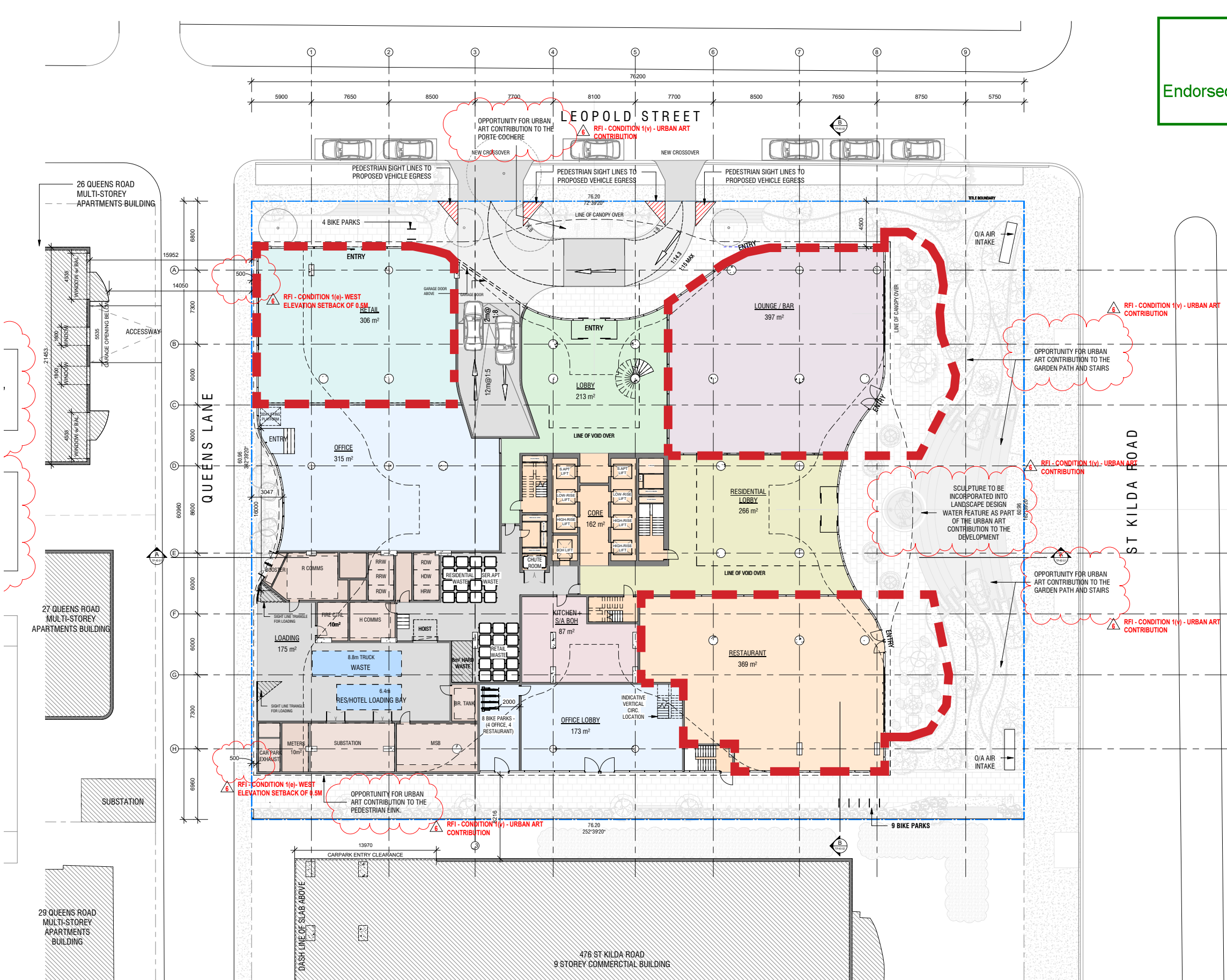
GROUND FLOOR - RED LINE PLAN

PORT PHILLIP PLANNING DEPARTMENT Date Received: 16/07/2020