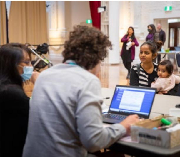
A mother and child attend an Immunisation Session.

Despite our schools being closed, the high school immunisation program for students in Year 7 and Year 10 has also been delivered in the same safe manner.