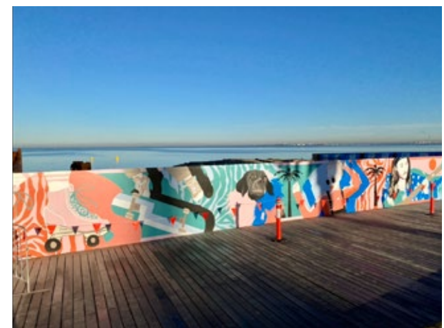
Drain hoardings mural artwork