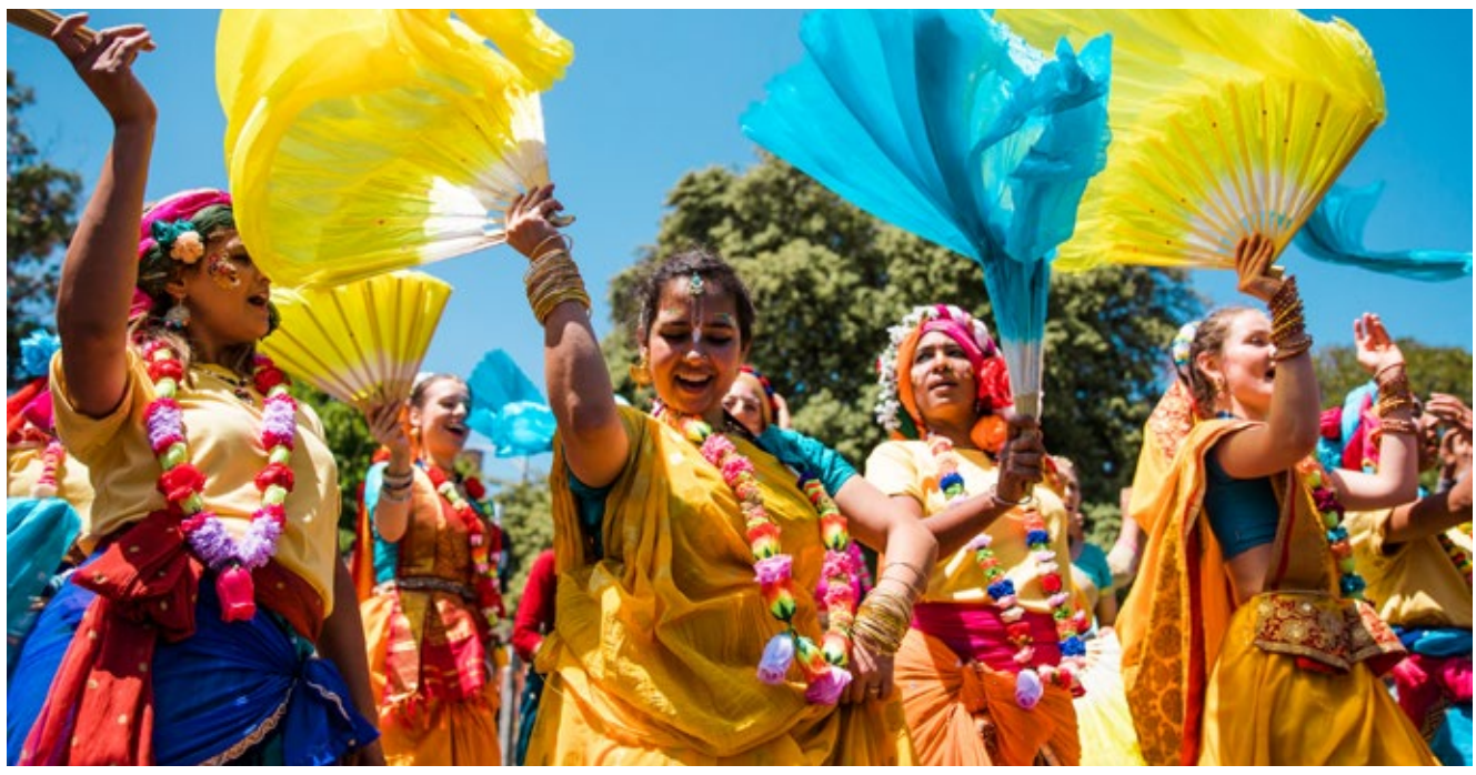
St Kilda Festival - Parade (2019)

Council cannot wait to welcome you back.