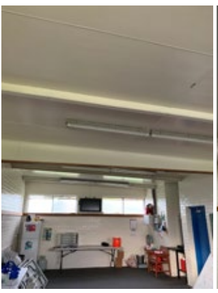
Pavilion Ceiling (Before)

We also used the opportunity to upgrade affected lighting to new energy-efficient LED lighting, creating a renewed facility and good outcome for all community users.