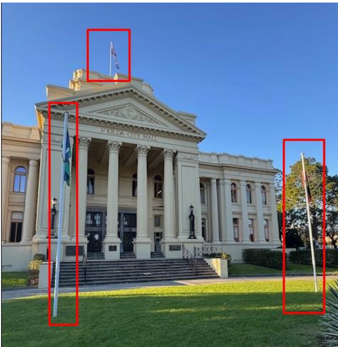
SKTH civic flagpoles