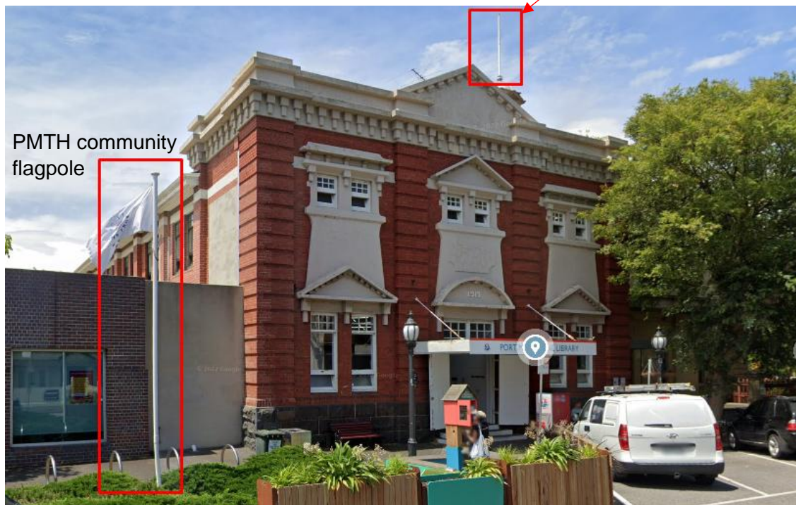
PMTH community flagpole