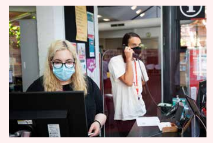
Library Services re-opened its doors to the public in November 2021.