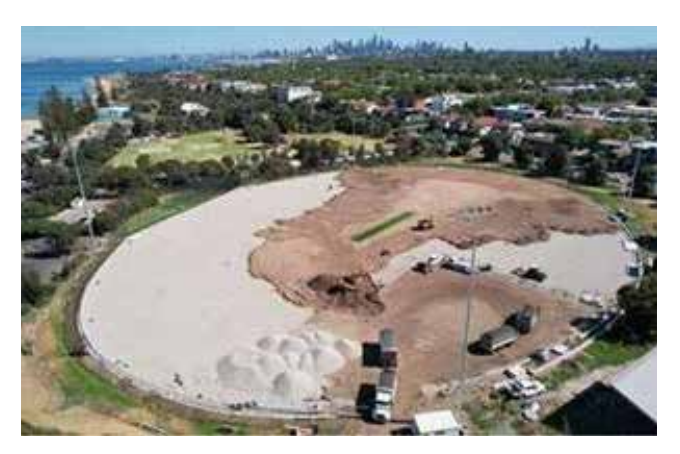
The oval redevelopment includes the levelling of the new ground profile.

The project has a total budget of $1.74 million. The project is supported by the Victorian Government.