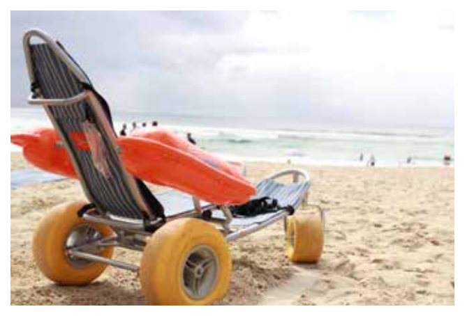
At St Kilda and Port Melbourne beaches Mobi-chairs and beach matting connect the boardwalk to the water.