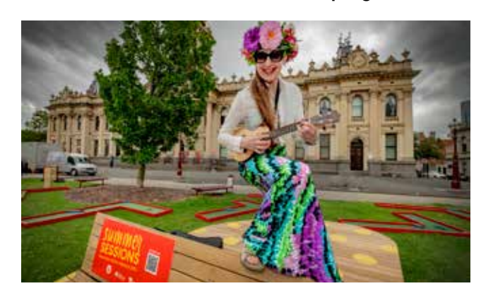
Festivals are reopening across the City.