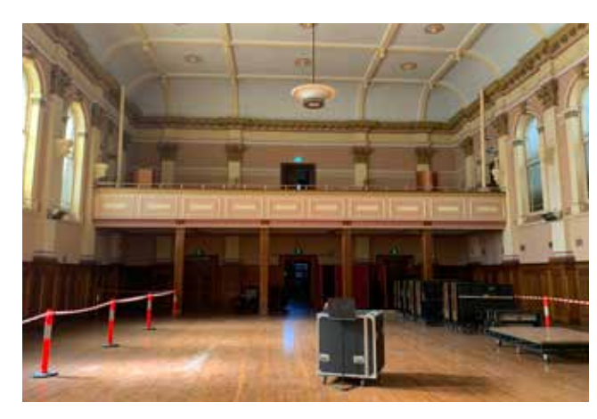
Site investigations for the South Melbourne Town Hall's renewal and upgrade.

A detailed methodology and proposals addressing how they would approach the myriad of different issues at the site along with their prior experiences in similar works and other high-profile heritage locations were the selection criteria for choosing the design studio.