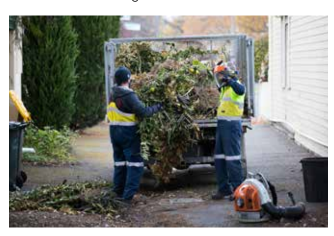
Street cleaning after major storms in November.

The months of November and December saw our street cleaning service performance remaining above 90 per cent (delivering a monthly performance rating of 92 and 91 per cent, respectively). Street and beach services continued to respond to emergency cleans over the period of following three weeks after the major storm events in early November that seen all residential street and foreshore locations affected by fallen trees and infrastructure damage.