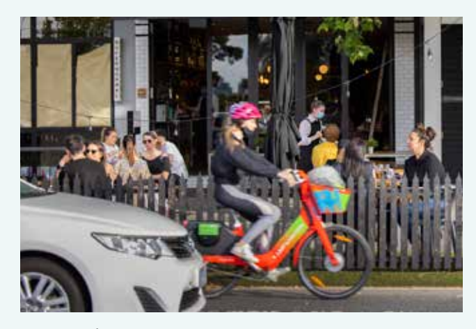
A range of courses ran through summer and Autumn focusing on safe e-bike riding.