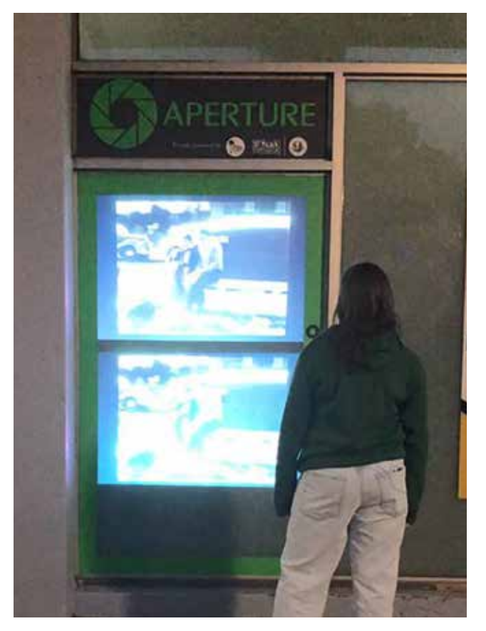
As part of Aperture, Council provides creative collaboration by curating ongoing content with local screen-based businesses and organisations.