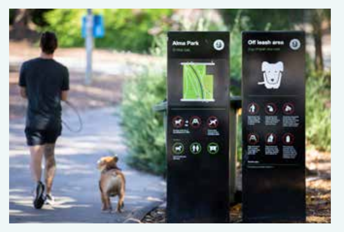
The local laws and animal management teams work to ensure responsible pet ownership.