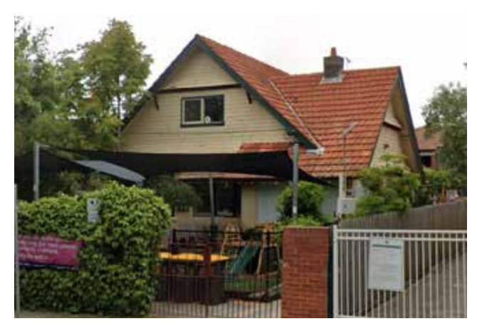
Council has invited submissions on the proposed sale of three Council-owned properties including 46 Tennyson Street, Elwood.