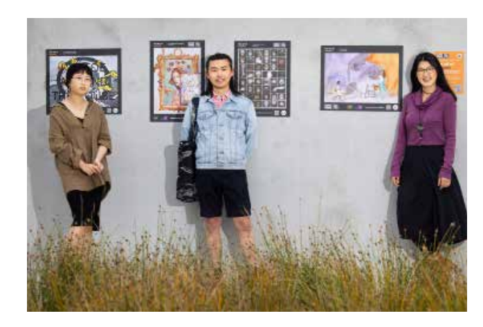
Artists with their artwork produced for the 16 Days of Activism campaign

City of Port Phillip kick started the 16 Days of Activism against Gender-Based Violence campaign on 25 November 2021, the International Day for the Elimination of Violence Against Women.