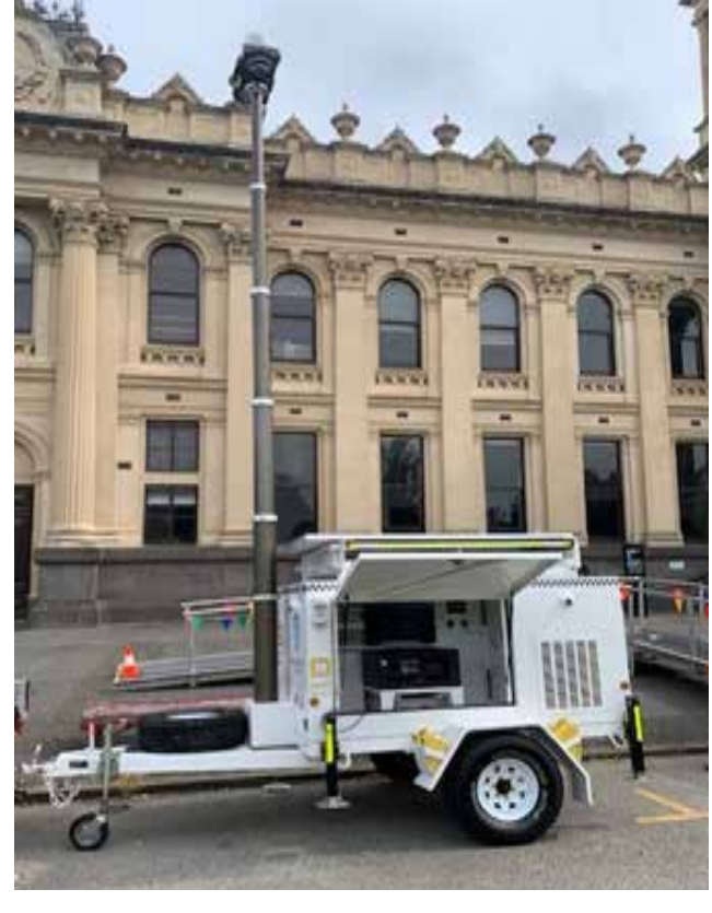
Mobile CCTV trailer is being deployed across various locations across our City.

We are receiving positive feedback from the community commenting on their improved sense of safety.