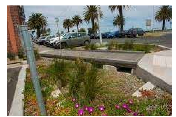
Raingardens help improve water quality by trapping litter and filtering invisible pollutants.

Raingardens are a natural filtration system that cleans stormwater runoff from the street before it enters our stormwater drains and eventually the bay. Raingardens help improve water quality by trapping litter and filtering invisible pollutants. Once clean, the water leaves the raingarden through a pipe below the soil into the stormwater drain and then into the bay. Raingardens are also used to slow the flow of stormwater to protect aquatic habitats and reduce the risk of flooding.