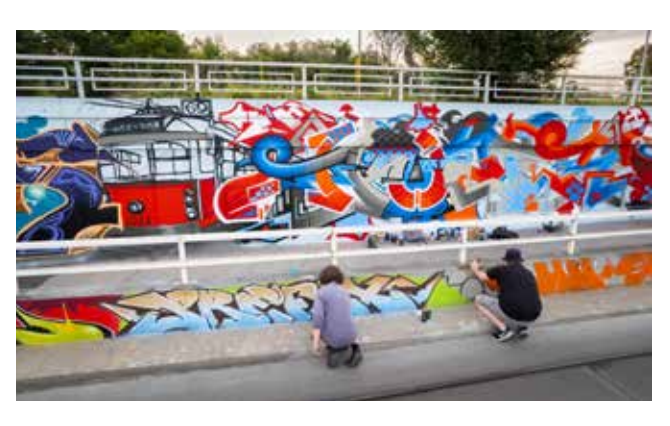
The mural celebrates the junction's history and heritage.