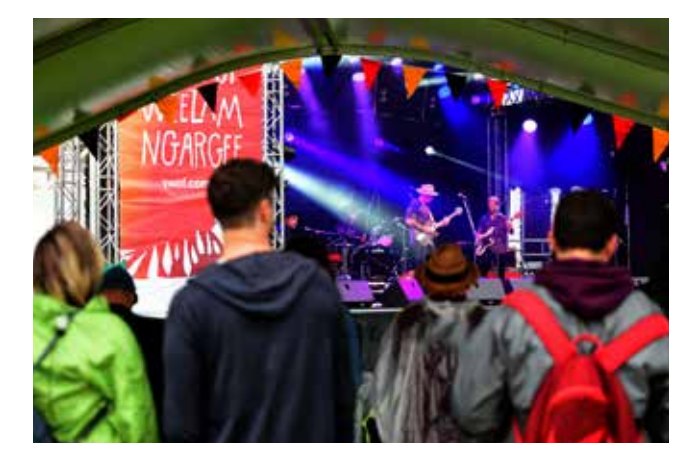
We're committed to regularly reviewing our internal events like the Yaluk'ut Weelam Ngargee festival.