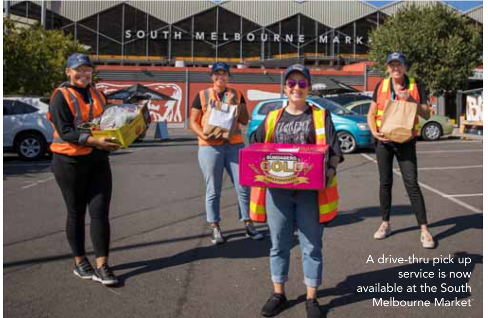
A drive-thru pick up service is now available at the South Melbourne Market

Meals services will continue to operate, but may be subject to closures or changes, pending further government announcements.