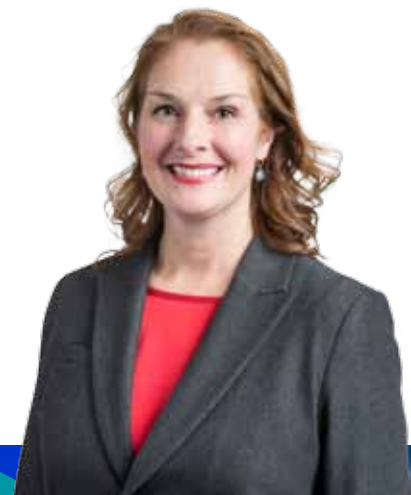
Cr Bernadene Voss Mayor City of Port Phillip