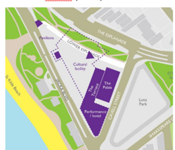
Masterplan ca. 22,000m2