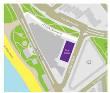
The Palais (today) ca. 2500m2