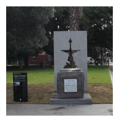
Edwin Knox Memorial Cleve Gardens, St Kilda (sk0008) Erected 1902 Reinterpreted 2013

Local veterans and community members advocated for the restoration of this memorial. Following Burra Charter principles, and with support from the community, an interpretive approach was developed which referenced and acknowledged the original ornamental fountain through a contemporary interpretation. A panel noting the history of the fountain, and documenting the interpretive and conservation works, was also installed.