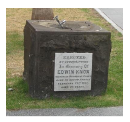
The memorial in a deteriorated state