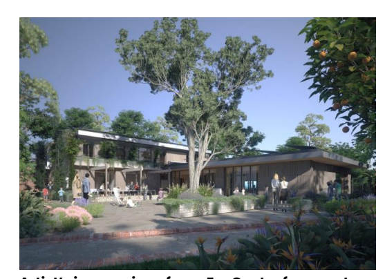
Artist's impression of new EcoCentre forecourt

Construction is expected to commence in April 2023 and be completed by late 2024. The project is funded in partnership with the Victorian Government.