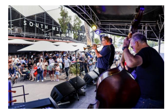
Port Phillip Mussel and Jazz Festival 2023 at South Melbourne Market

South Melbourne Market partners with The Nature Conservancy all year round to recycle oyster, scallop and mussel shells so they don't end up in landfill. The Shuck Don't Chuck program sees shells used in a reef restoration project aimed at rebuilding the precious ecosystems in Port Phillip Bay.