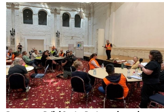
Emergency Relief Centre Post exercise review