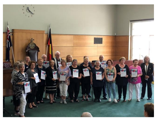
Representatives from multicultural seniors groups at St Kilda Town Hall.

These community groups help ensure Port Phillip is rich with cultural diversity and an inclusive space for all.