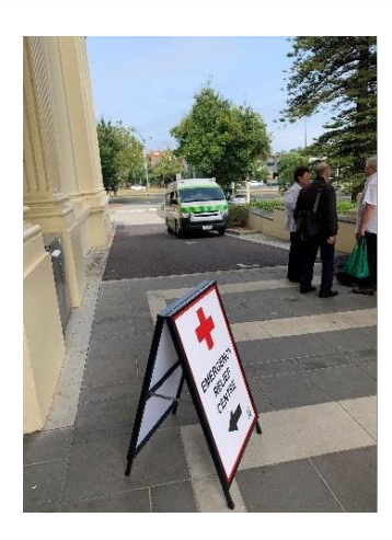
Emergency Relief Centre entrance

The exercise aimed to enhance the awareness and knowledge of staff and supporting agencies in ways to best coordinate a large-scale evacuation and the management of an emergency relief centre. It mitigates risk and enhances preparedness to respond to a major emergency.