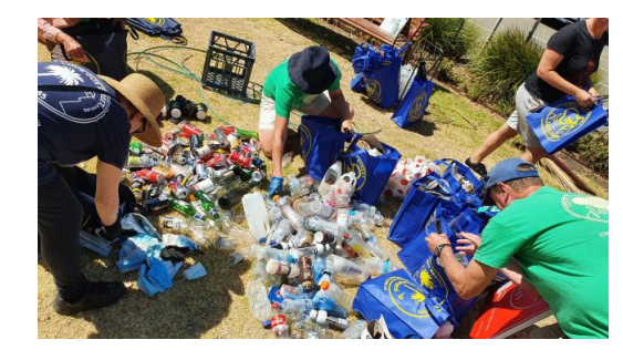
Litter Counting on Clean Up Australia day

Alternatively, you can pledge to avoid single use plastics, opt for reusable coffee cups or head to the St Kilda Repair Café instead of throwing things out. We can all play a part in keeping our city clean and beautiful.