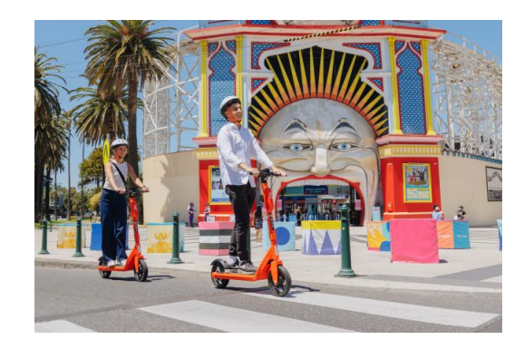
Riders using e-scooters

We look forward to working with the Victorian Government in evaluating the ongoing e-scooter trial.