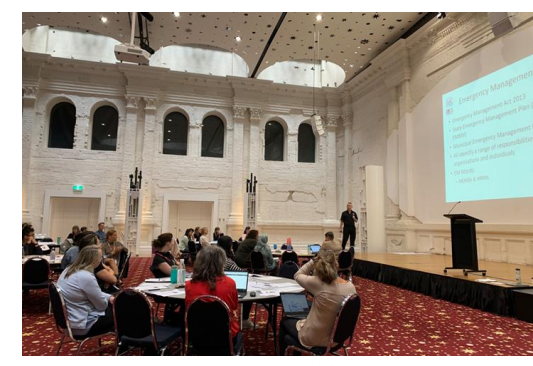
Emergency Relief Centre training

The training aimed to enhance the awareness and knowledge of staff in ways to best coordinate the management of an emergency relief centre