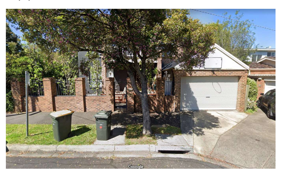
Figure 3 – subject site from Wenden Grove frontage (Google street view, October 2019)

The proposal does not breach the covenant.