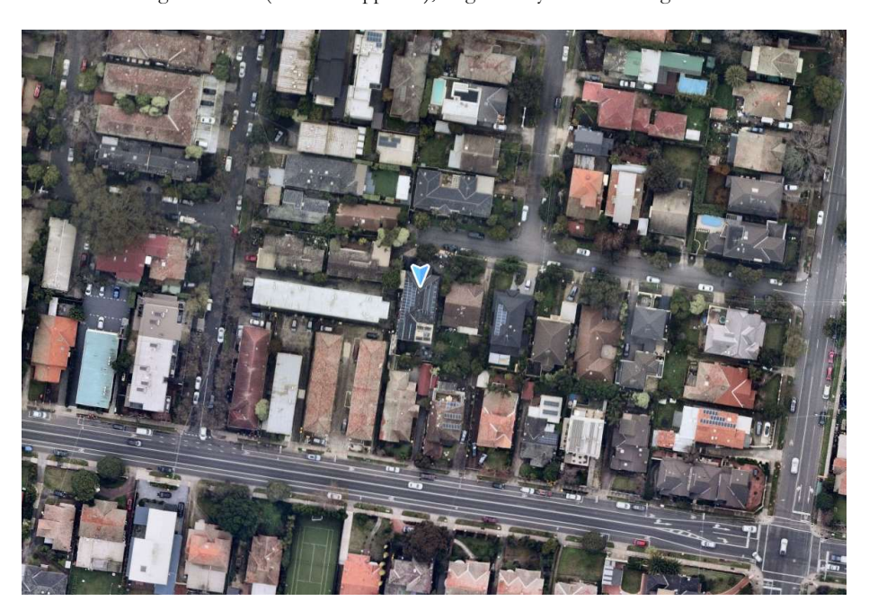
Figure 4 – Aerial image of surrounding land (Nearmaps, 28 June 2022).