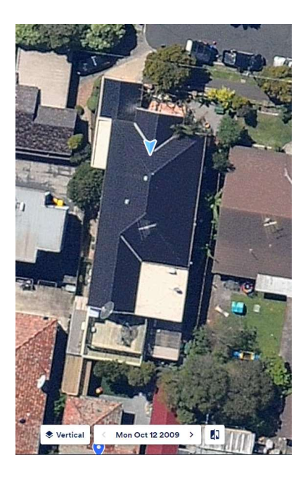
Figure 6 - site conditions on 12 October 2009.

The subject site located within an area of aboriginal cultural sensitivity. The use for a rooming house (residential building) is a high impact activity. Despite this, the land has been subject to significant ground disturbance (SGD) and as such, a rooming house is not a high impact activity in accordance with regulation 58 (4) under the Aboriginal Heritage Regulations 2018 . Upon review of recent and historical aerial imagery, it is clear that the land has undergone SGD by virtue of the construction of existing/past structures and buildings on-site. Refer to aerial image below: