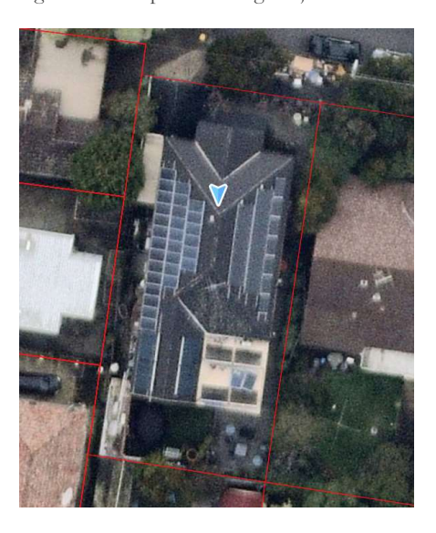
Figure 2 – Aerial imagery of site