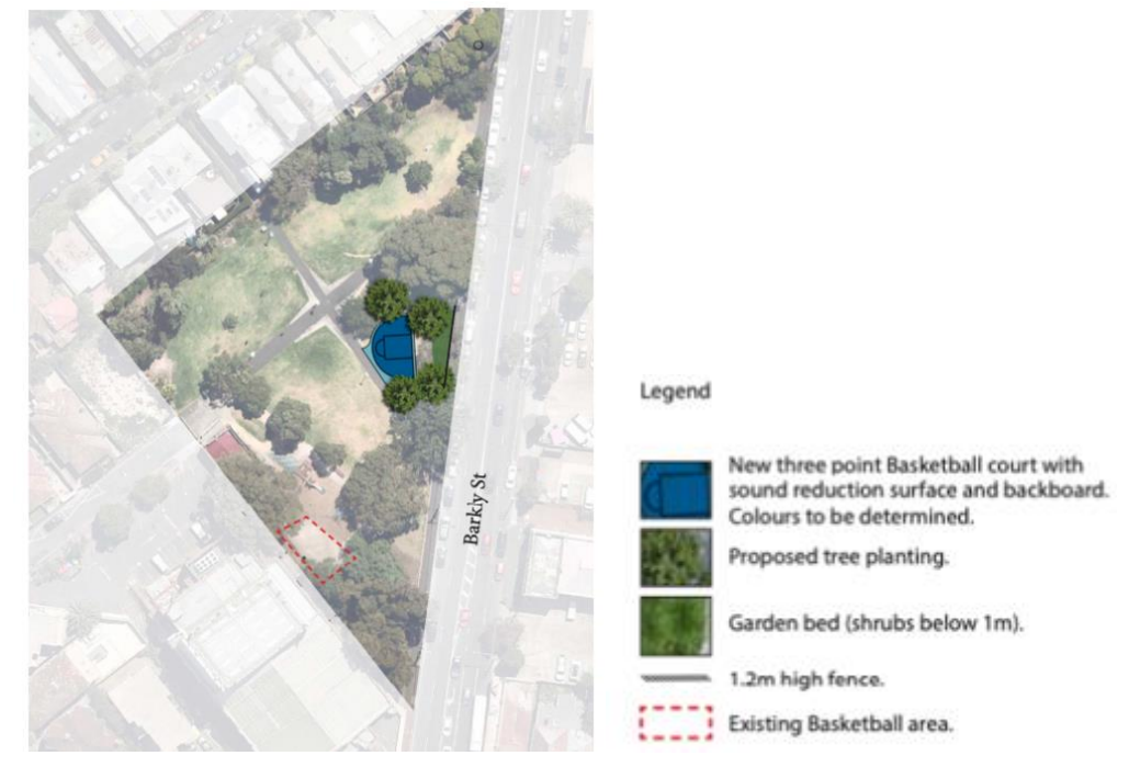
Image 3: Location of basketball court within J Talbot Reserve (Proposed Design)

4.16 Key features of the draft concept plan include: