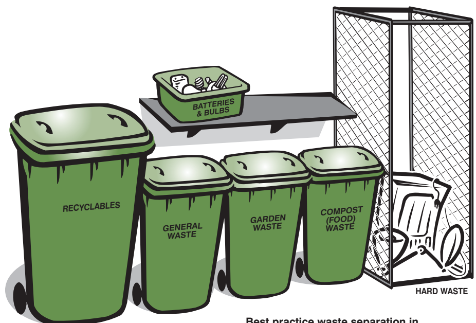
Best practice waste separation in multi-unit residential developments.

Construction sites can represent a great burden on local waterways. Site litter, paint, solvents, bricks, cleaning substances and clean-fill can all contaminate stormwater runoff. It is an offence under the Environment Protection Act to discharge contaminated water into the stormwater system. To avoid contamination, ensure that a drainage system is installed before construction activities commence and storm water is diverted from areas where soil is exposed.