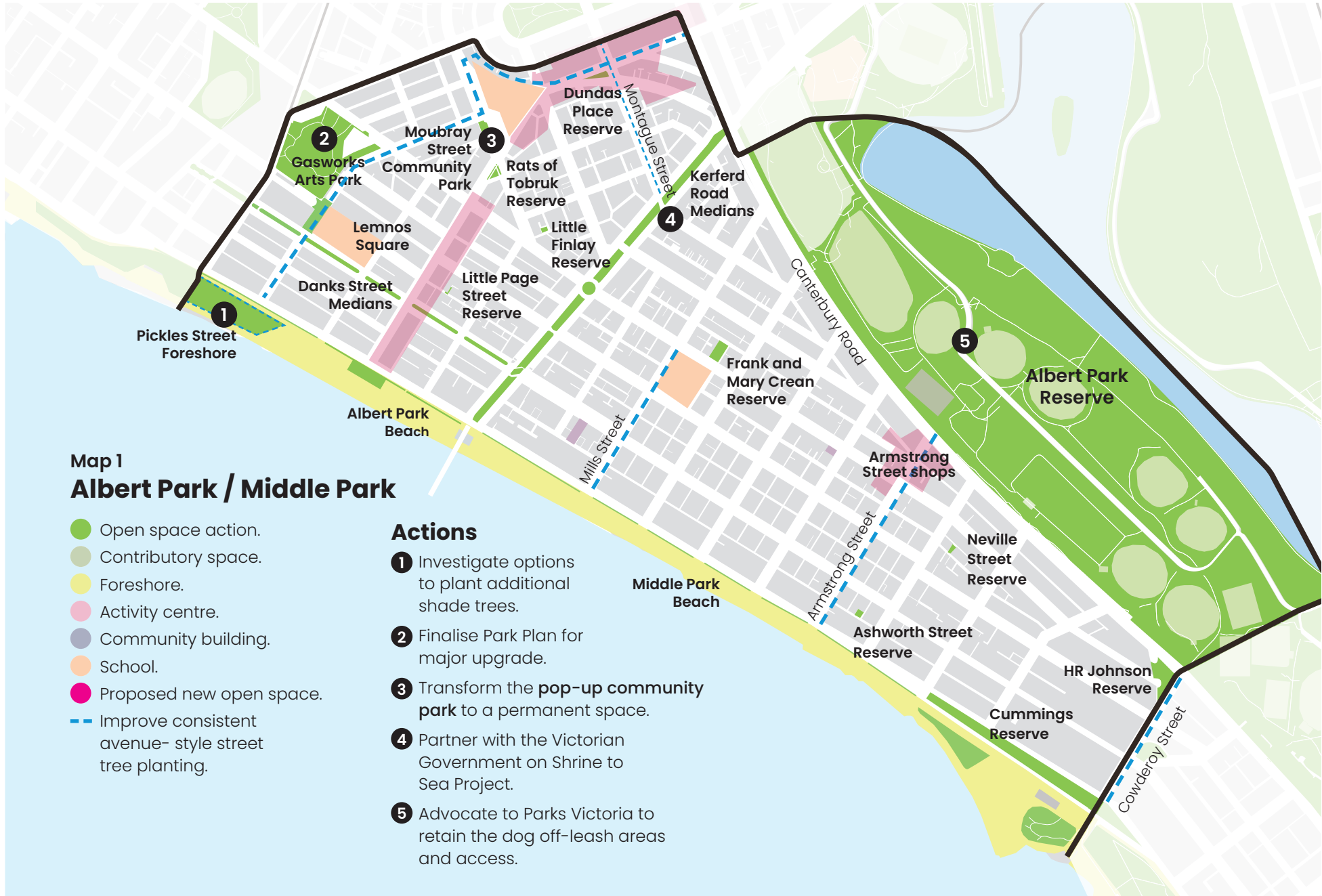
Map 1 Albert Park / Middle Park