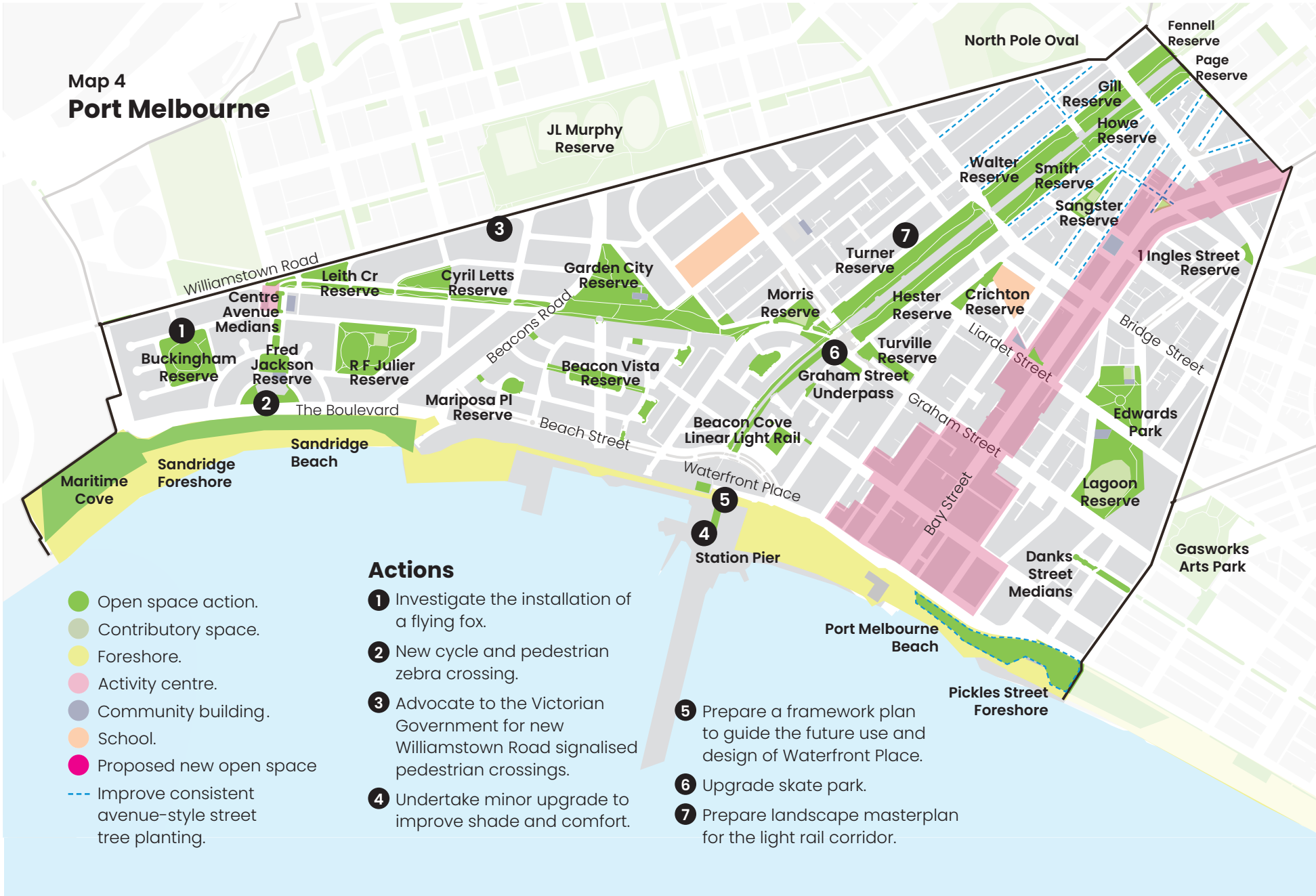
Map 4 Port Melbourne